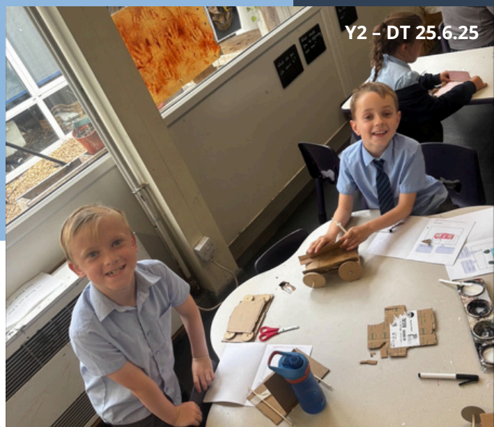
Y2 - DT 25.6.25