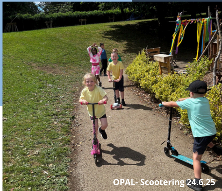
OPAL- Scootering 24.6.25

Year 6 have had a great week full of wider curriculum topics and play practice ready to perform to the school and parents. In Computing, the children have designed and created their own quizzes based on a story book from foundation or a topic of their choice. To do this, they included multiple question types. In RE, they have looked at how Jewish people responded to Nazi hatred with a link to the Kindertransport programme. In Science, they have completed a filtration demonstration before learning about the process of filtration and evaporation. In DT, they have researched different examples of upcycling ready for when they design their own next week. In Geography, they have learnt about what globalisation is and how it impacts different social groups and countries across the world. Next week, they are going to be looking at the significance of the Berlin Wall and continuing with their play practice.