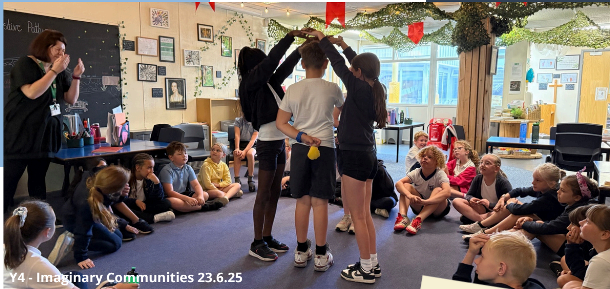
Y4 - Imaginary Communities 23.6.25