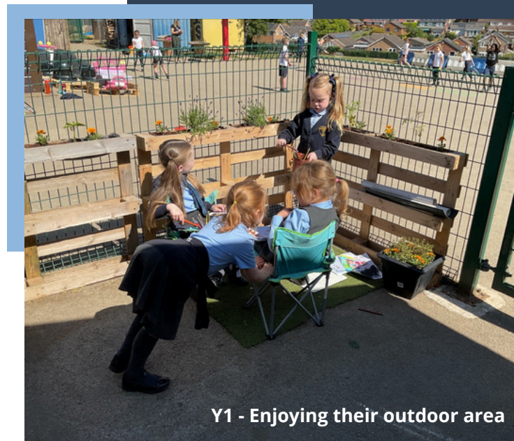
Y1 - Enjoying their outdoor area

This week in Year 3 the children have continued their Fractions unit, looking at adding, subtracting and making a whole. In English we did a hook session for our new unit, an informative article about the Battle of Hastings. We created our own frieze frame of the Bayeux Tapestry and then explored a WAGOLL. We discussed the impact of the features used and thought about their importance within the piece. In RE the children designed their own church based on their learning of Christian worship spaces. In Science, we drew the life cycle of a non-flowering plant and thought about how this differed from a flowering plant. In P4C we explored the difference between relational conflict and bullying. In History, we looked at the Battle of Hastings and a range of primary and secondary sources. Year 3 are very excited about our topic and can't wait to find out more!