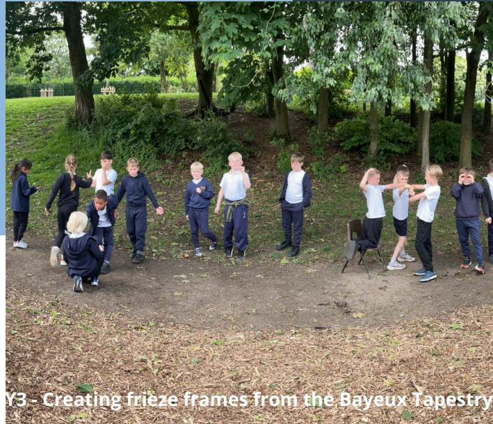
Y3 - Creating frieze frames from the Bayeux Tapestry

It's been a busy first week back for Y4. The children have committed themselves to revising their times tables in preparation for their multiplication check next week. In English, they have started their unit based on writing their own adventure story in a Tudor style. The children have looked at the features of an adventure narrative and have analysed an example of a story. They were able to pick out examples of fronted adverbials, dialogue and expanded noun phrases to describe the character and setting. In Science, the children have been exploring tooth decay and how this happens. We have started an experiment using egg shells where we have placed them into a range of different liquids – fizzy pop, toothpaste, vinegar and tea. We will monitor these egg shells to help us understand how certain liquids can cause tooth decay. In Music, we are going to learning more notes on our recorders to be able to perform our own compositions later in the term.