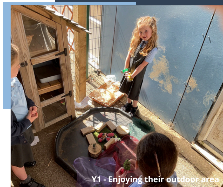
Y1 - Enjoying their outdoor area