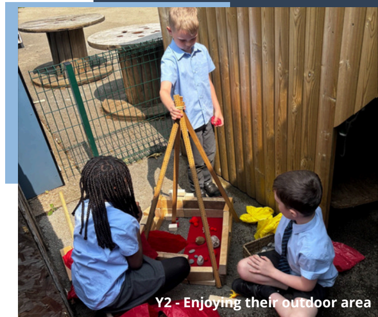
Y2 - Enjoying their outdoor area