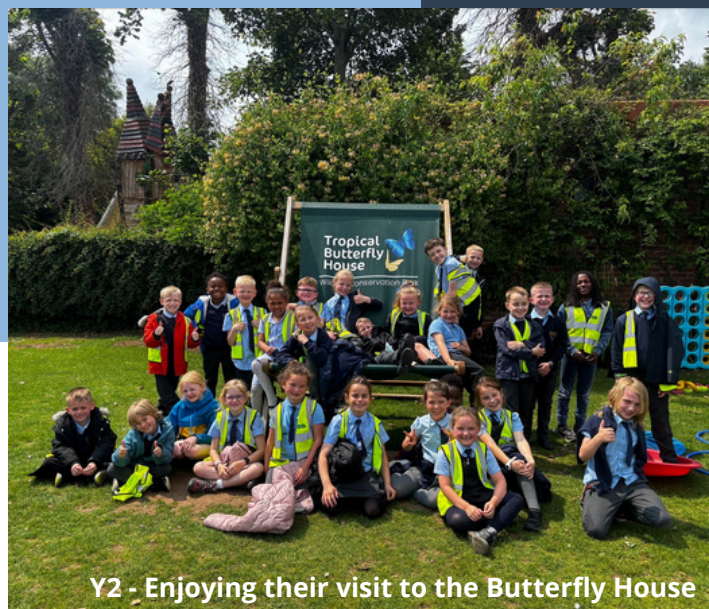
Y2 - Enjoying their visit to the Butterfly House

Year 6 have had a lovely week completing lots of writing. As part of their final outcome, they have planned their own mysterious story with a focus on dialogue. They have worked extremely hard on this and will finish it next week. In Computing, they have finished their blogs and evaluated their partner's work. In PE, they have completed their final bleep tests. All of the children are so excited to begin practising their end of year play!