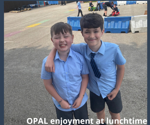
OPAL enjoyment at lunchtime