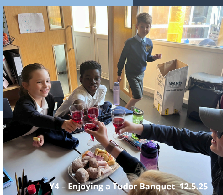
Y4 - Enjoying a Tudor Banquet 12.5.25