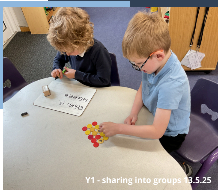
Y1 - sharing into groups 13.5.25