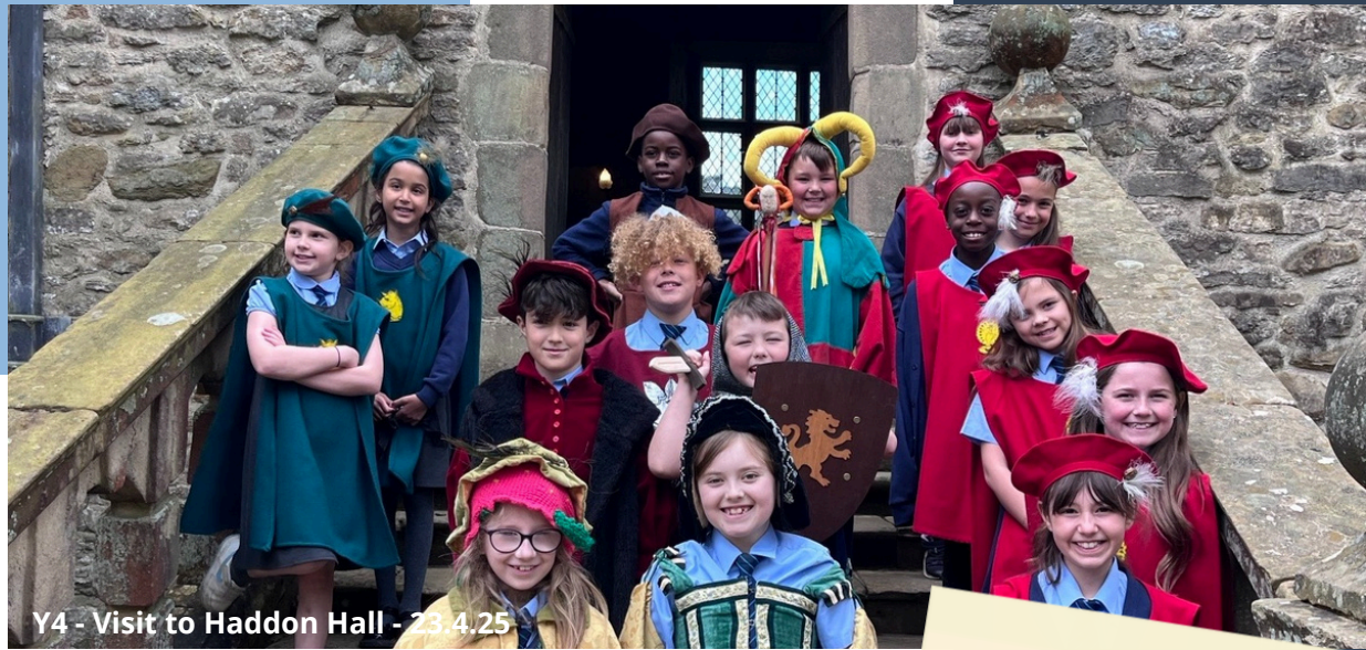
Y4 - Visit to Haddon Hall - 23.4.25