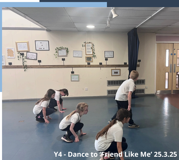
Y4 - Dance to 'Friend Like Me' 25.3.25