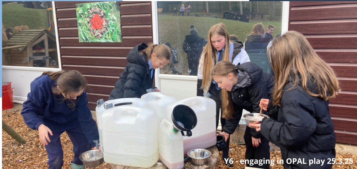
Y6 - engaging in OPAL play 25.3.25