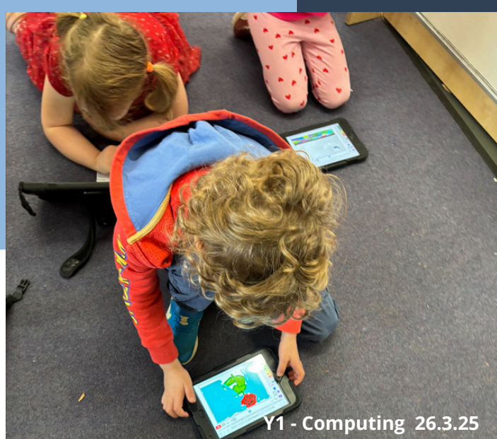
Y1 - Computing 26.3.25