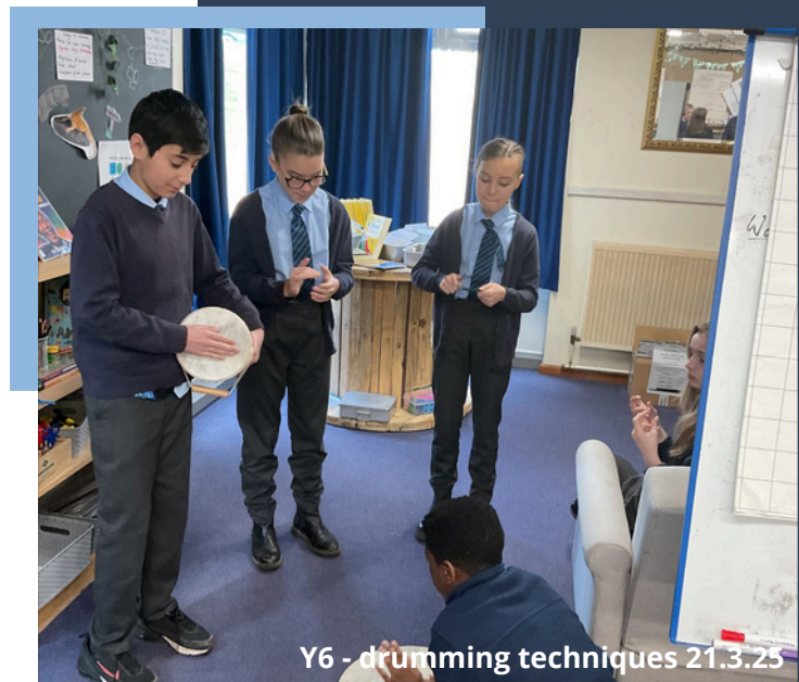
Y6 - drumming techniques 21.3.25