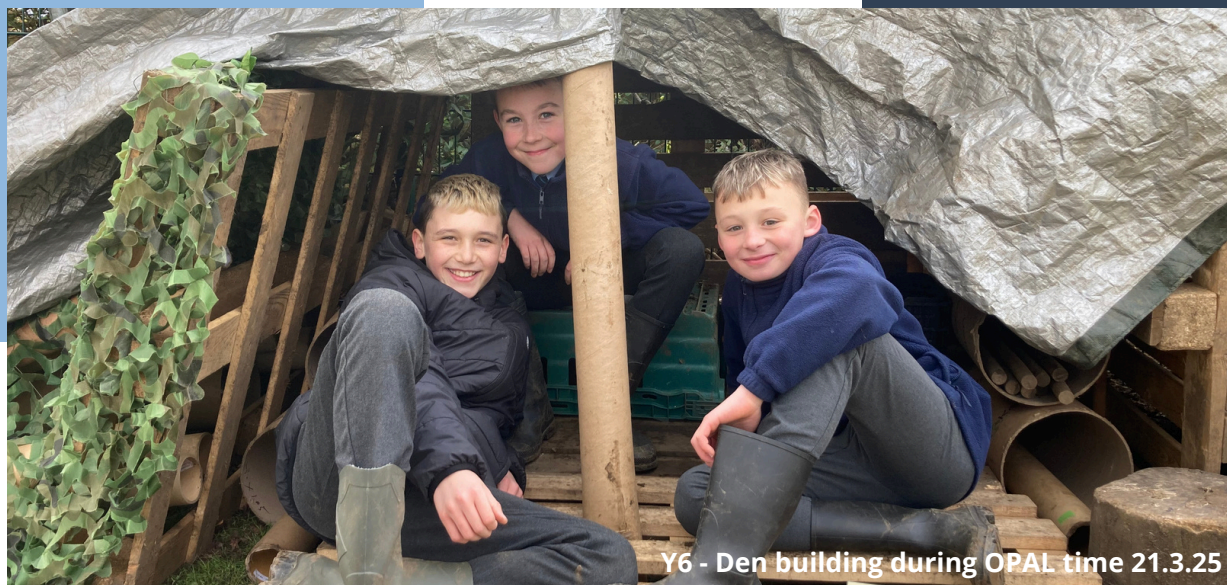
Y6 - Den building during OPAL time 21.3.25