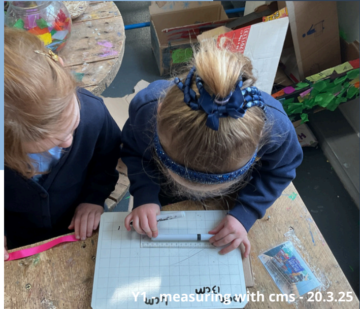
Y1 measuring with cms - 20.3.25