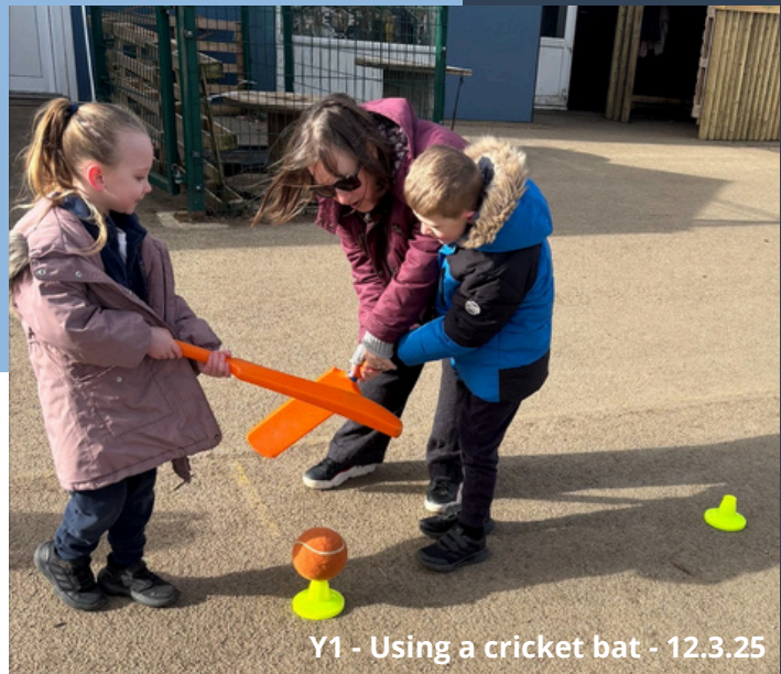
Y1 - Using a cricket bat - 12.3.25

Year 6 have had yet another busy week full of learning! In English, they have completed their narrative stories based on the digging of Stanley's first hole. Some children chose to end their story on a cliffhanger which was lovely to see! In Maths, they have moved onto decimals, fractions and percentages and I must say 'WOW!' They have proven what brilliant mathematicians they are during this topic. In RE, they took part in a silent debate which challenged every child to compare ideas. Due to it being British Science Week, the children have completed an activity where they had to create a game that would be inclusive for everyone, regardless of their abilities. In Art, they have learnt about aperture and how this can be created within different images. To end the week, they took part in a skateboarding session, which they loved! Next week, they are going to start a new unit in English where they will write a sequence of letters to Stanley's family.