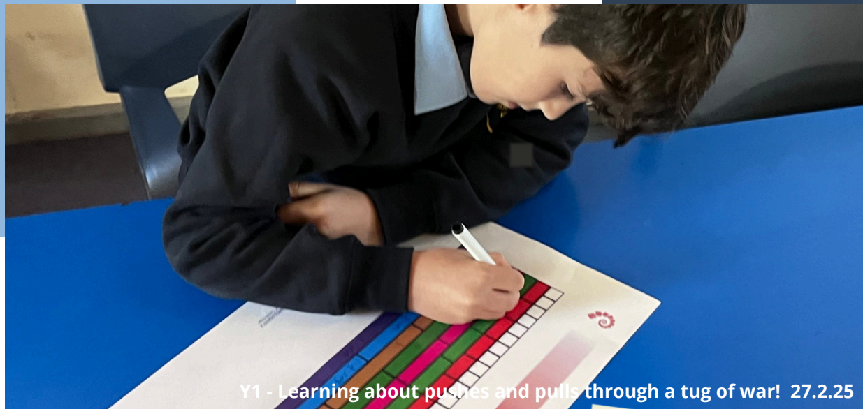
Y1 - Learning about pushes and pulls through a tug of war! 27.2.25