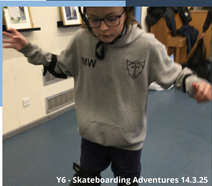
Y6 - Skateboarding Adventures 14.3.25