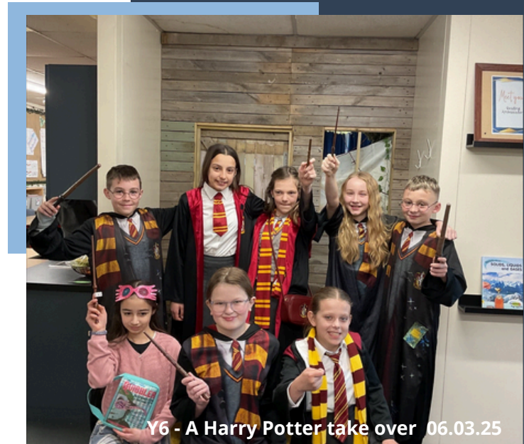
Y6 - A Harry Potter take over 06.03.25