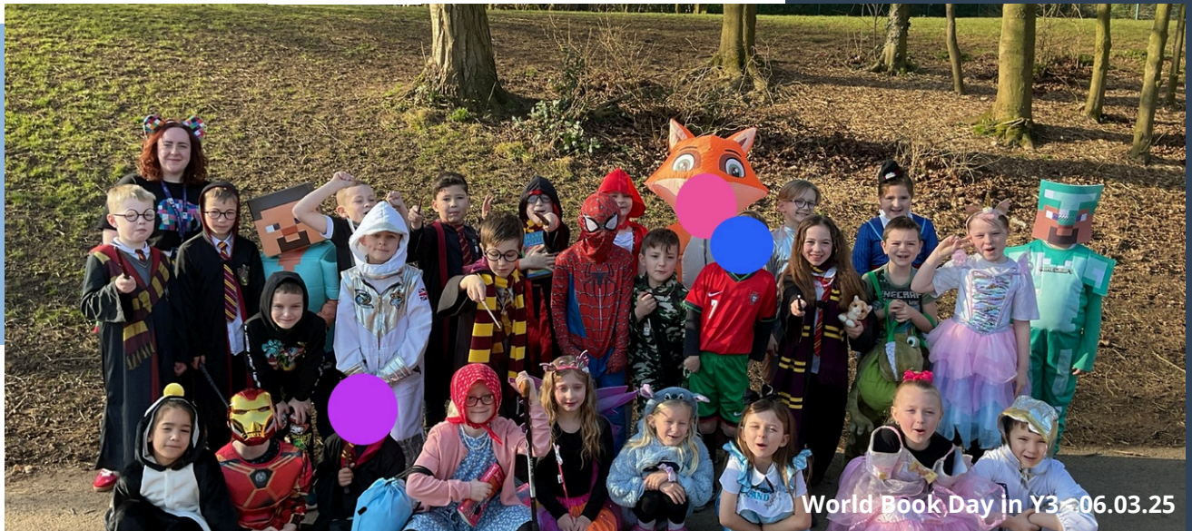
World Book Day in Y3 - 06.03.25