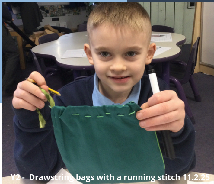
Y2 - Drawstring bags with a running stitch 11.2.25