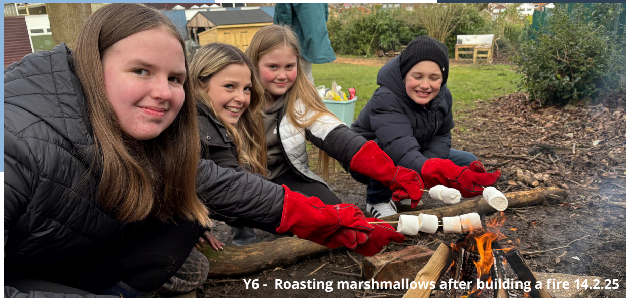
Y6 - Roasting marshmallows after building a fire 14.2.25