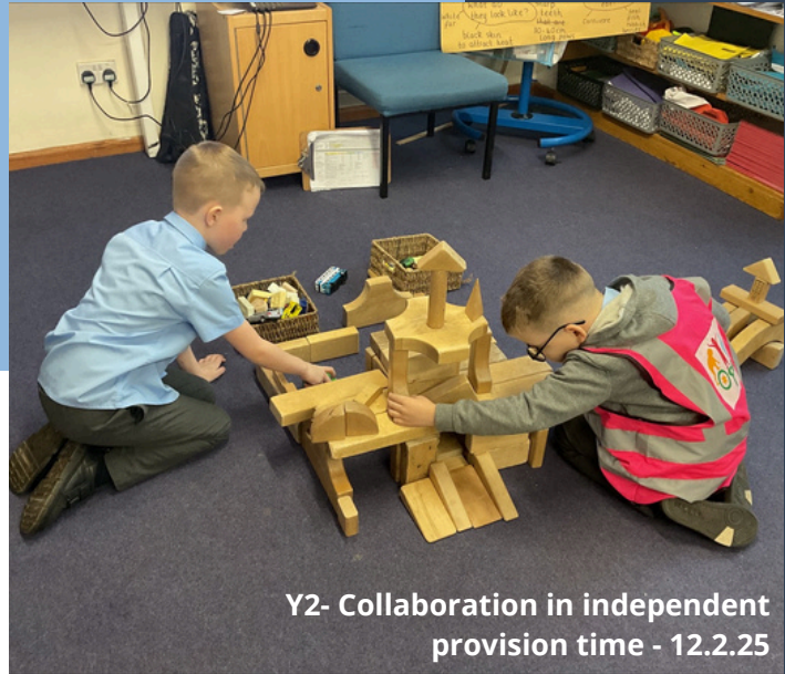
Y2- Collaboration in independent provision time - 12.2.25

Year 6 have had a tricky week completing their new assessments. However, they have worked fantastically and shown me what they are truly capable of and they should be very proud of themselves. In English, they have completed an independent piece of writing regarding a formal speech on a topic that they have felt passionate about. In Maths, they have finished their topic of algebra and have absolutely smashed it! We really do have some proper mathematicians. In RE, they have considered how the world is currently compared to how Jesus would have wanted it to be before linking this to the Bible. In Science, they have considered the impact that a healthy lifestyle can have on your body and what the implications are of not having one. To finish the week off, they have taken part in an outdoor learning session where they have used fires to roast some marshmallows!