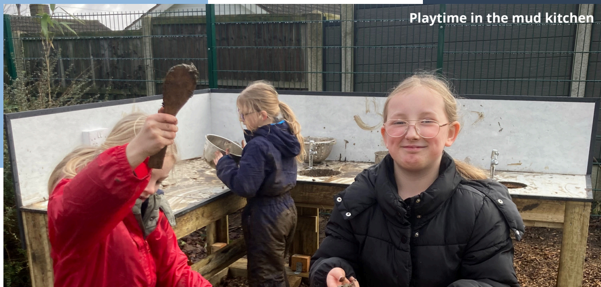
Playtime in the mud kitchen