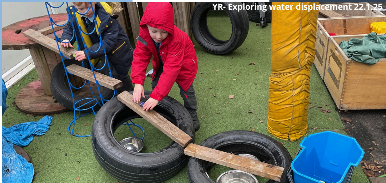
YR- Exploring water displacement 22.1.25