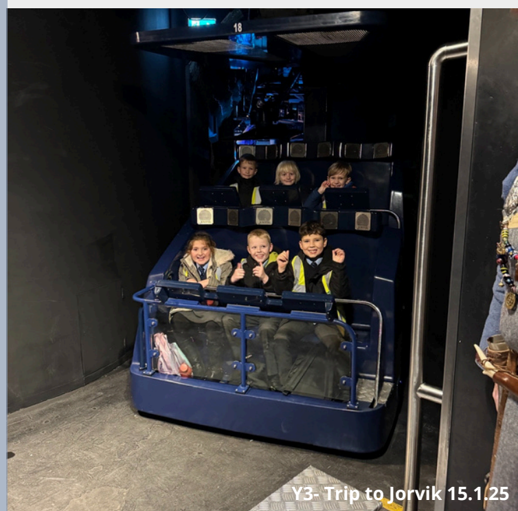
Y3- Trip to Jorvik 15.1.25

Year 6 have worked extremely hard this week to produce their own biographies about Nelson Mandela. Next week, they will be beginning to unpick a persuasion piece of writing in preparation of when they write their own to the House of Commons. In Maths, they have moved onto the topic of ratio and wow! What superstars they have been! In RE, they have considered what the Lord's Prayer means in relation to the Kingdom of God. In art, they have recapped why it is important to draw things to the correct scale before they move onto contour lines next week. In science, they have been learning about the heart, including the cloze procedure, after learning about the components of blood. In music, they have considered how different dynamics could be played on the drums. Next week, they are going to consider what secondary sources can tell us about the events of apartheid, as well as the limitations of these.