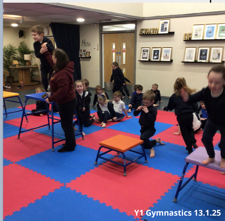
Y1 Gymnastics 13.1.25