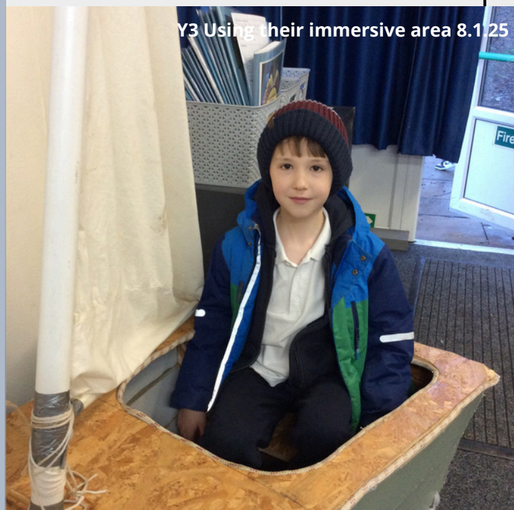
Y3 Using their immersive area 8.1.25