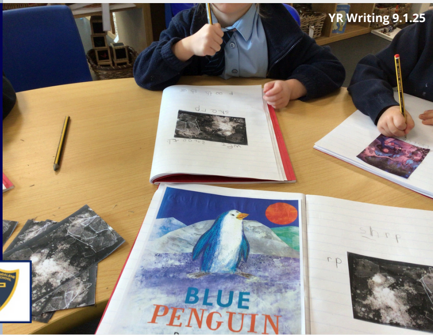
YR Writing 9.1.25