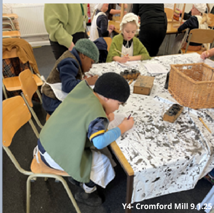
Y4- Cromford Mill 9.1.25

Year 6 have had a fantastic first week back in school! In English, they have been learning about what makes an effective biography. After this, they researched about Nelson Mandela and the fight against apartheid. In Maths, they have been learning how to convert units of measure to complete a variety of calculations. In Spanish, they have recapped their prior knowledge of sports to answer different types of questions. In History, they have learnt about Apartheid and Nelson Mandela's imprisonment. In Computing, they have learnt about whether something is done for views or the news and how this can be identified. In Science, they have recapped the components of blood before moving onto how the heart works next week. In RE, they have unpicked two parables and considered how this links to the Kingdom of God before they move on to unpick the meaning behind the Lord's Prayer next week.