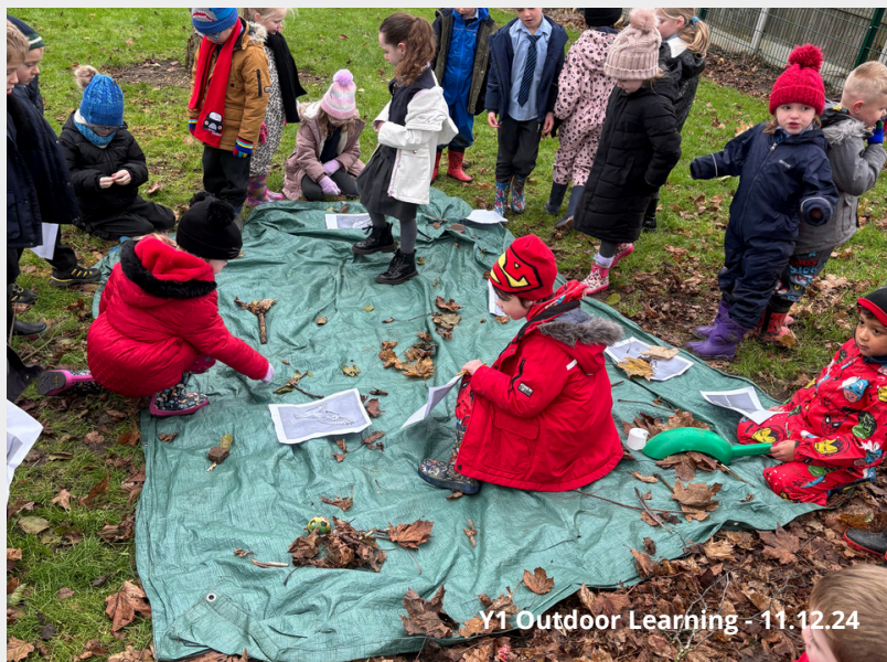
Y1 Outdoor Learning - 11.12.24