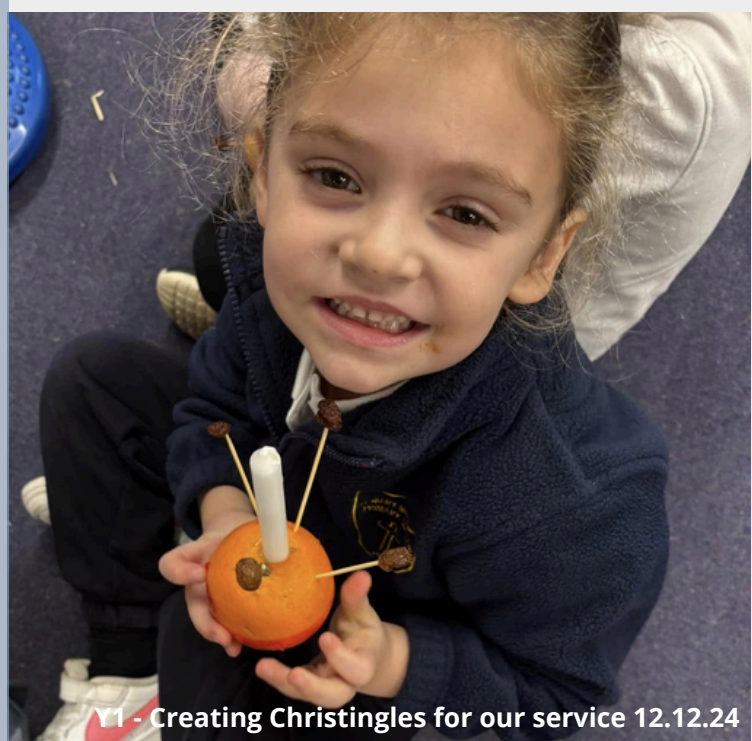
Y1 - Creating Christingles for our service 12.12.24

Year 6 have had yet another splendid week! In English, they have researched an endangered species that featured on the deadly60 program before planning and beginning to write their own informative article about it. In Maths, they have moved onto multiplying and dividing fractions with problem solving questions. In RE, they have considered how and why people do not care for God's Earth and have given suggestions as how to people could instead. In DT, they have created their own planes using K'Nex. In Computing, they have created a simple, yet effective, switch using the binary system that they have spent the last term learning about. In History, they have considered how and why the breaking of the enigma code was important and the impact it has had on the 21st century. Next week, they are going to continue with their informative articles and their topic of fractions in maths.