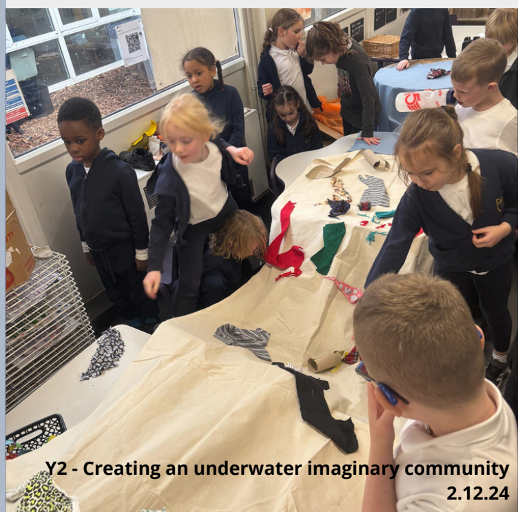
Y2 - Creating an underwater imaginary community 2.12.24

Year 6 have worked extremely hard this week to complete their first mock SATs. They have all worked extremely hard and it has all paid off. In Maths, they have been learning how to add and subtract complex fractions before moving onto mixed numbers next week. In DT, they have begun to create their planes in small groups using k'nex. This is something they will finalise over the coming weeks. In English, they have watched a documentary about the endangered species that walk our planet. In RE, they have considered how some working professionals would show their beliefs about God being the creator in relation to Psalm 8. In Spanish, they have begun to create their own tourist information leaflets using all of the vocabulary they have learnt so far. In Science, they have continued to work on the fossils they have made by document. Next week, they will move onto the second part of their fractions topic and use an exemplification material in English to form their own success criteria.