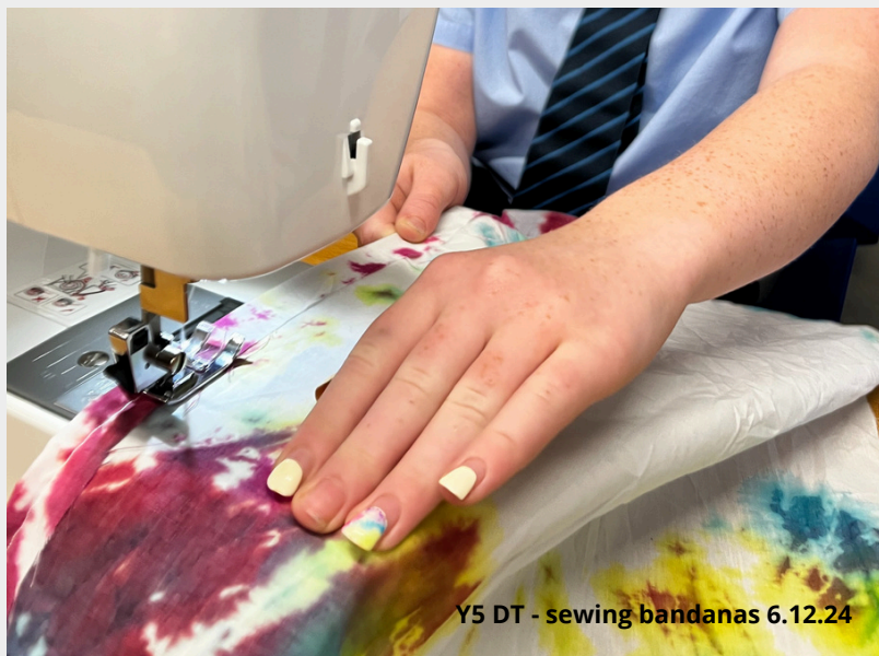
Y5 DT - sewing bandanas 6.12.24