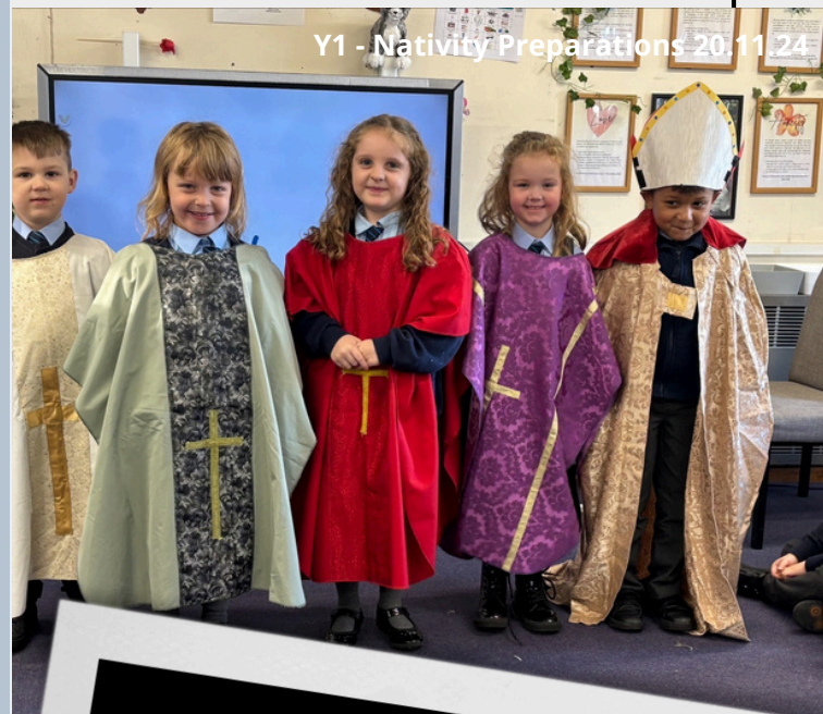
Y1 - Nativity Preparations 20.11.24