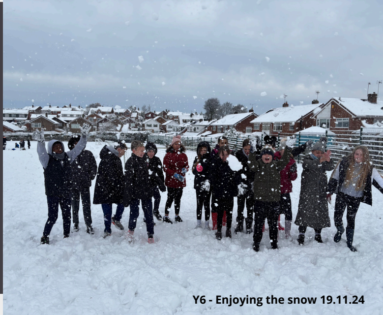
Y6 - Enjoying the snow 19.11.24