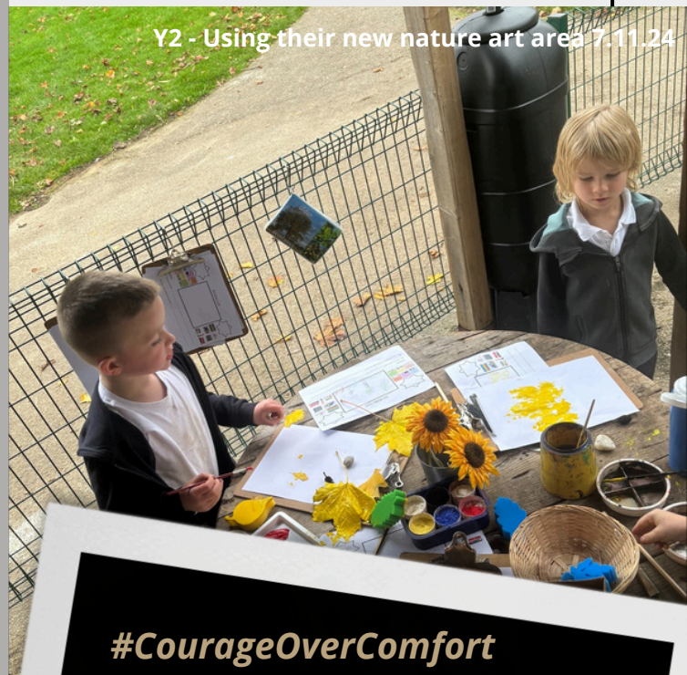
Y2 - Using their new nature art area 7.11.24