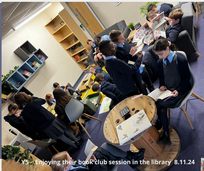
Y5 - Enjoying their book club session in the library 8.11.24