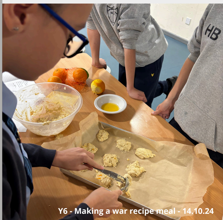
Y6 - Making a war recipe meal - 14.10.24

What a wonderful week of learning year 6 have had! In English, they have written, edited and published their persuasive leaflets all about the dig for victory campaign. In Maths, they have continued to work hard to understand and develop their methods of long multiplication. It has taken some time, but they have worked extremely hard to answer questions correctly. In RE, they have considered how they, the school and the world can be loving, holy and forgiving of others. In science, they have conducted an enquiry into different areas of the world and have classified the living things that can be found there. In computing they have considered how to use 'user input' within codes to allow for messages and commands. In DT they have created and evaluated their own two-course meals inspired by WW2. In geography they have walked their circular routes to the local secondary schools and have evaluated how and why they had to adapt their routes based on the current weather conditions. After the half term, they will move onto long division and will begin narrative writing.