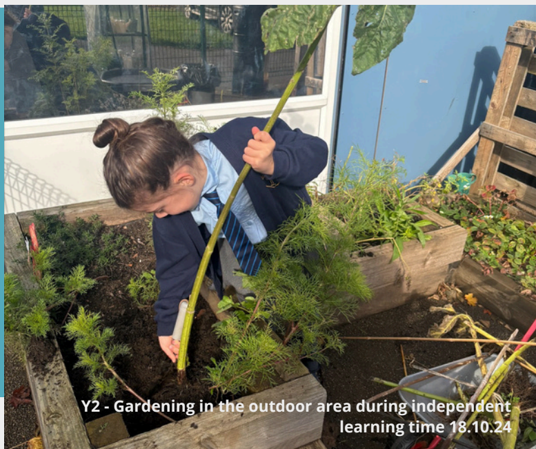
Y2 - Gardening in the outdoor area during independent learning time 18.10.24