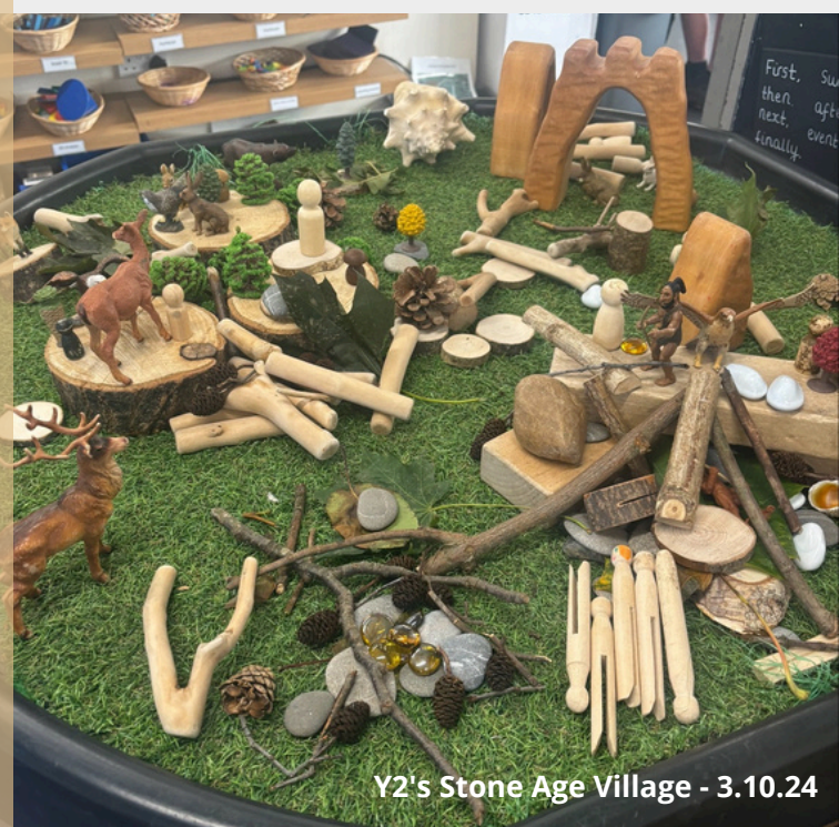
Y2's Stone Age Village - 3.10.24

Year 6 have done so many wonderful things this week. In English, they have started their persuasive leaflets by analysing an exemplification piece before practicing their persuasive features. As a hook to this unit of writing, they started by planting cress and designing their own dig for victory leaflets. In maths, they have been learning about common factors and multiples. In RE, they have learnt about a section of proverbs and have considered how and why forgiveness can be difficult but also right. In computing, they have learnt how to create functions using variables to create their own turtle game. In Geography, they have used their orienteering maps with the Y5s to find OS symbols around the school grounds. Some of the Y6s have been to a handball competition this week and have won! Next week, everyone will be writing their own persuasive leaflets and making their own two course meals in DT.