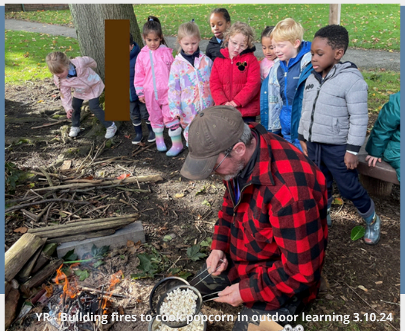
YR - Building fires to cook popcorn in outdoor learning 3.10.24