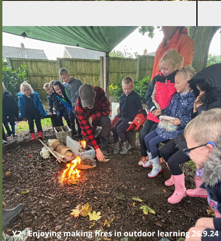
Y2 - Enjoying making fires in outdoor learning 26.9.24