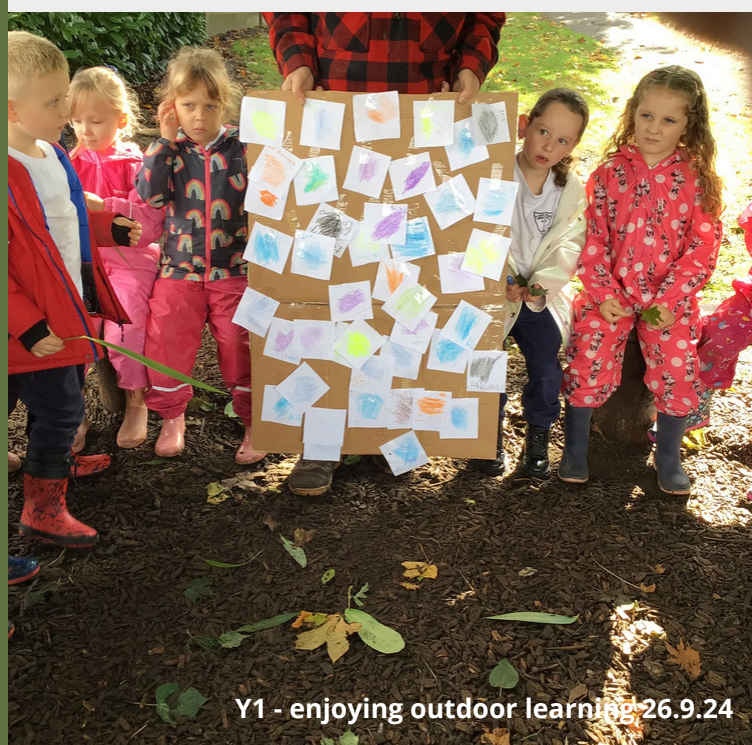
Y1 - enjoying outdoor learning 26.9.24

Year 6 have had another wonderful week full of learning! In English, they have published their diary entries and produced an independent piece of writing which was beautiful. In maths, they have moved onto a topic of addition and subtraction. They have found this quite tricky and have been using concrete resources to support their learning. Additionally, they have done about negative number lines practically which they did fantastically at! In RE, they have considered how being loving could impact the world today. In geography they have continued to create their orienteering maps for Y5 to use next week. In DT, they have designed their own two course meal which they will start to make over the next couple of weeks. In PE, they have been learning about special awareness to promote effective moment. Next week, they will begin a new piece of writing which is all going to be about persuading people to evacuate during the war.