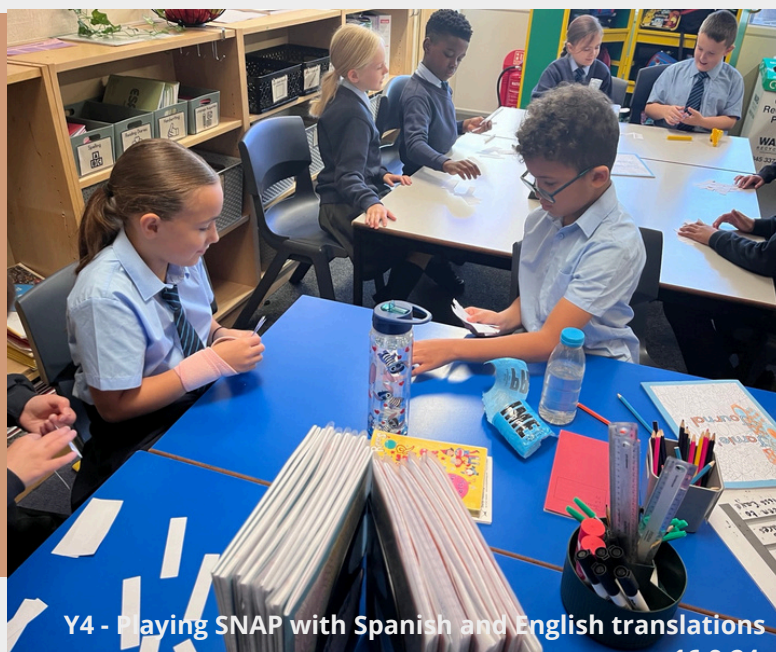
Y4 - Making SNAP with Spanish and English translations