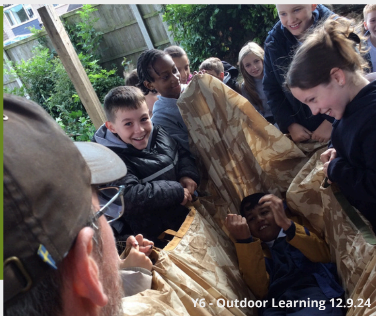
Y6 - Outdoor Learning 12.9.24