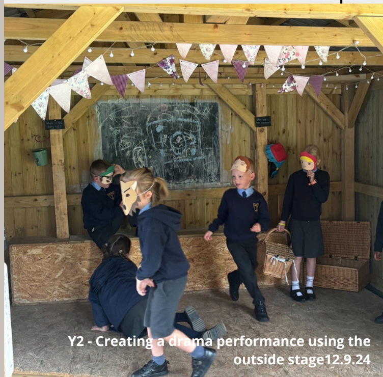
Y2 - Creating a drama performance using the outside stage 12.9.24