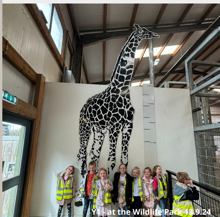
Y1 - at the Wildlife Park 13.9.24

What a wonderful week Year 6 have had! They have started so many new topics and have produced some lovely work. In English, they have travelled back in time to an air raid from WW2 and are producing a diary entry about what the event was like and how they were evacuated. In Maths, they have started their topic of place value by working with numbers up to 10,000,000. In RE, they have considered what the Trinity is and why it is important. In Science, they have researched and produced a fact file about Carl Linnaeus and the work he contributed to the world of science. In DT, they have learnt about rationing, the Dig for Victory campaign and what types of food would have been rationed and why. To finish the week off, they have done an outdoor learning morning with the Peak District Survival School, learning all about habitats, WW2 and how to make their own fire to cook popcorn. What a fantastic way to end the week!