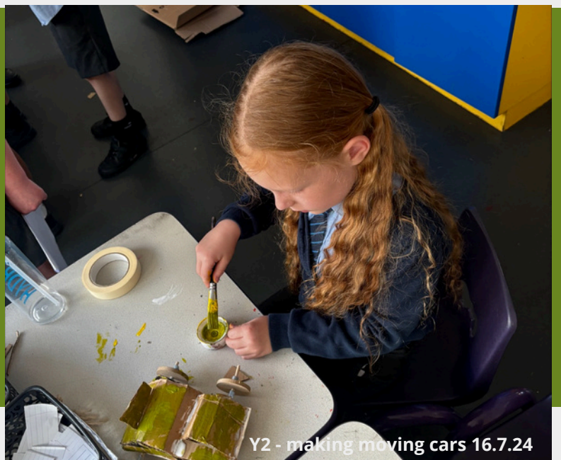
Y2 - making moving cars 16.7.24