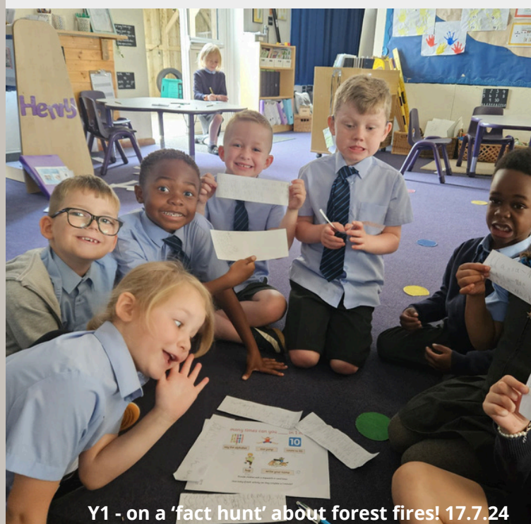
Y1 - on a 'fact hunt' about forest fires! 17.7.24

Year 6 have been super busy this week. Some of us started the week with some with transition days to secondary school, whilst others completed DT projects and charity shop visits. We've all been busy with performance practice, and the all important Prom. The children then put on a fantastic performance of 'Cinderella Rockerfella'. Next week they have an equally busy week with their final evening performance, family picnic and Leavers Service.