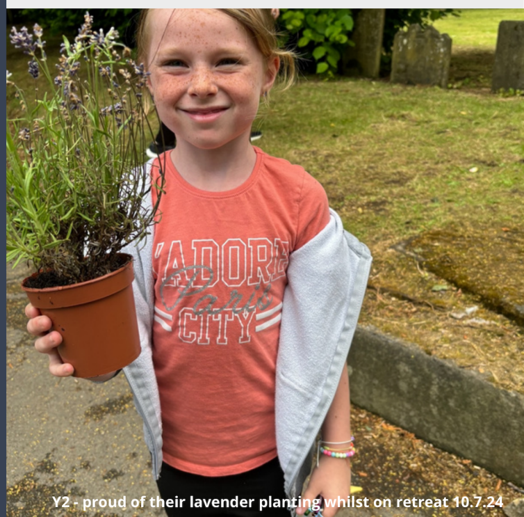
Y2 - proud of their lavender planting whilst on retreat 10.7.24

Year 6 have had a lovely week. It began with a Spiritual Retreat at St Mary's Church and ended with a special transition day at Southwell Minster which the children thoroughly enjoyed. In between all that we have continued our History topic on Post-War Berlin and looked at the relations between the East and the West, we are going to explore the impact of the Berlin Wall. We have been busy with our preparations for our end of year production of Cinderella and Rockerfella, the children will make you so proud when you come to watch their performance. Next week we will be beginning our DT upcycling project and putting our final touches to the production ready for the first performance on Thursday 18th July.