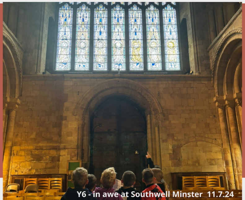
Y6 - in awe at Southwell Minster 11.7.24