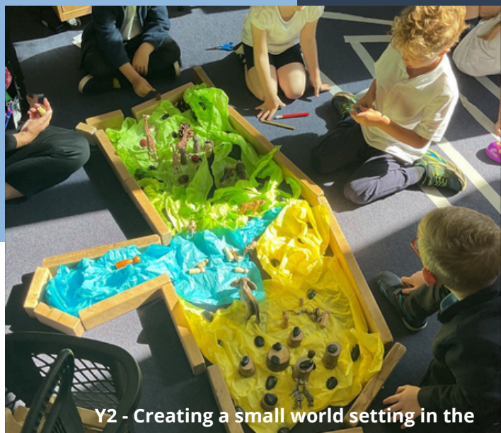
Y2 - Creating a small world setting in the continuous provision