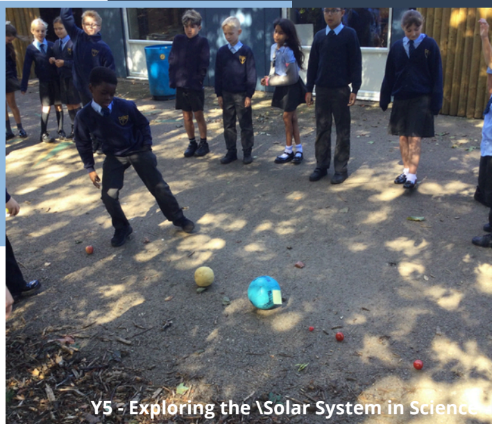
Y5 - Exploring the \Solar System in Science