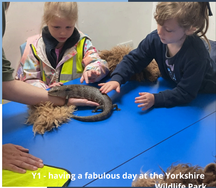
Y1 - having a fabulous day at the Yorkshire Wildlife Park