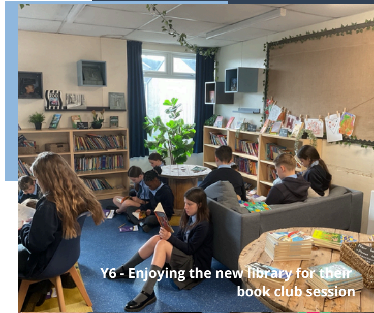
Y6 - Enjoying the new library for their book club session