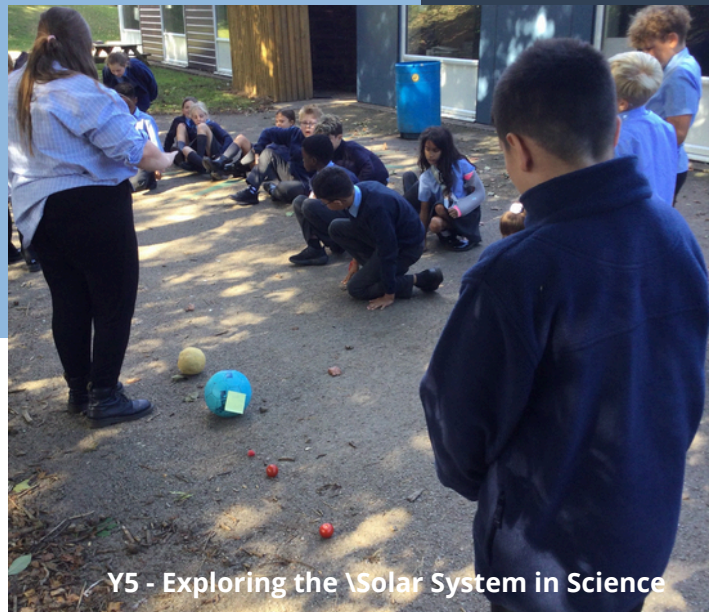
Y5 - Exploring the \Solar System in Science

Year 6 have had a great week. In English, they have been analysing a diary entry from WW2 before planning their own using the features that they have practised throughout the week. In Maths, they have considered how to use powers of 10 to answer complex questions, as well as using number lines accurately. In RE, they have analysed 3 bible tests to consider how they show God as being Holy and Loving towards his people. In P4C, they have considered why consent is important by exploring the stimulus, Rose Blanche. In Science, they have worked together to create their own classification branches to categorise flowering and on-flowering plants. They also had a great time exploring the new library! Next week, the children are going to write their own diary entries based on an air raid siren that goes off in the classroom and will begin to move onto addition and subtraction.