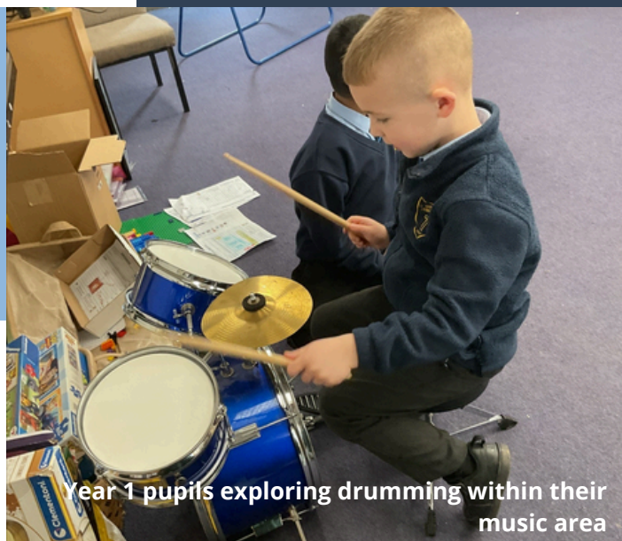
Year 1 pupils exploring drumming within their music area

This week in Year 3 we have continued with our Length and Perimeter unit, looking at comparing and adding lengths. In English we have been writing our survival guide, the children have loved researching about Antarctica! In Spanish we wrote a paragraph all about our pets but this time, included vocabulary linking to their colours. In Art we have designed and carved our tile ready to print onto our map background next week. The children have focused carefully on their use of symmetry and shape. In Geography we created vegetation belts to show the different types of flora and fauna in each biome. In RE we looked at the ways in which Hoy Week is celebrated and created, candles, palm crosses and traced the via dolorosa (the walk Jesus did when he carried the cross). Once again, the children had a great time swimming, and it is lovely to see their confidence build each week!