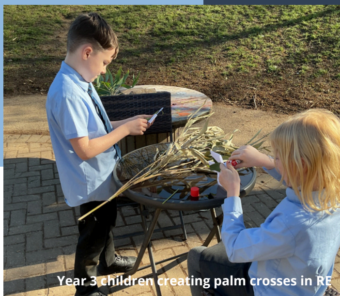
Year 3 children creating palm crosses in RE