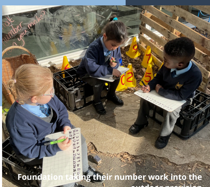
Foundation taking their number work into the outdoor provision