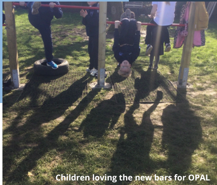
Children loving the new bars for OPAL

Year 4 have had a very busy and productive week. The children have shown great enthusiasm and focus across all subjects. In Maths, they learned about fractions on number lines and explored mixed and improper fractions. They practised converting between these and worked on identifying equivalent fractions. In English, the children began a Picasso-inspired unit linked to Spanish and Art. They used this theme to write detailed rainforest setting descriptions with rich vocabulary. In Computing, they discussed real and fake news and learned how to judge whether information is trustworthy. In Art, the children completed their final Picasso-style rainforest pieces using colour, shape and abstract features. In RE, they learned about Easter Week and created memory boxes to reflect on important moments in the story. In Music, the children edited and improved their compositions in preparation for next week's performances. In Science, they were introduced to classification keys and created their own using yes/no questions. They now have a stronger understanding of how scientists group and identify living things.