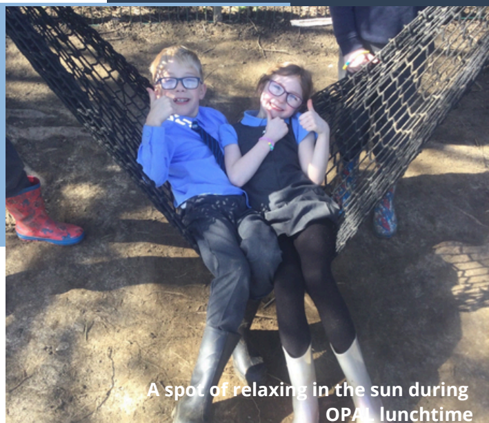
A spot of relaxing in the sun during OPA lunchtime

Year 5 have had a fantastic and busy week filled with learning and new experiences. The children took part in a road safety workshop where they learned how to stay safe near roads and make sensible choices as pedestrians. They showed great listening skills and asked thoughtful questions throughout. In PE, the class enjoyed developing their basketball skills, practising dribbling, passing and shooting before taking part in a friendly mini-game that showed excellent teamwork and sportsmanship. The children have also made a brilliant start on writing their non-chronological reports about bridges, gathering facts, organising information and beginning their first paragraphs with confidence. We are very proud of their enthusiasm and hard work this week!