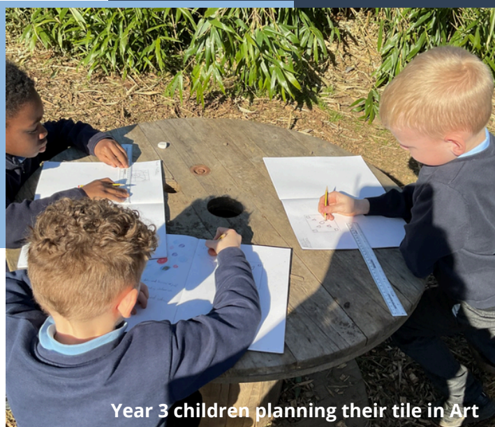
Year 3 children planning their tile in Art