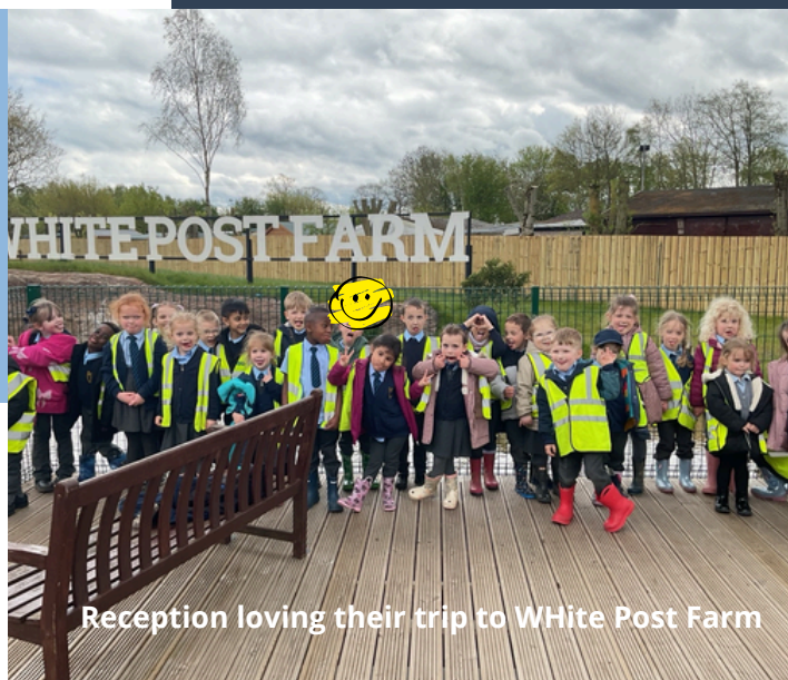
Reception loving their trip to White Post Farm

This week in Year 3 we have finished with our Length and Perimeter unit and are going to be moving on to look at Mass and Capacity. In English, we completed our 'How to Survive Lammas' independent write and watched 'The Lion The Witch and The Wardrobe' as part of our Hook Day for our new novel. In RE the children wrote their own prayers when learning about the way Christians worship and in Art, draw real life objects using ripples and dashed. In Computing we thought about trusted adults and safe spaces in school- the children had a great knowledge of this and thought of lots of places they felt safe in school! In Spanish we learnt the days of the week and chose which we liked and which we did not. In Art, we also finished our previous unit which was printing our tiles onto a map background.