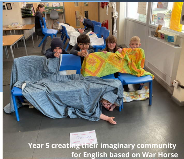
Year 5 creating their imaginary community for English based on War Horse

Year 5 have had a great start to their summer term. This week in Year 5, the children began their new novel study, War Horse , and used it as inspiration to create their 'imaginary community' spaces linked to the trenches, carefully selecting nouns and adjectives to bring their ideas to life. In maths, we continued our work on decimals, building confidence in reading, comparing and using them in different contexts. Our geography learning connected beautifully with our history theme as we explored coordinates of significant WWI locations. In P4C, the class discussed the importance of safe adults and safe places in school, sharing thoughtful ideas. In Spanish, we revisited numbers one to ten to strengthen fluency. Next week, we'll be writing a balanced argument in English, exploring percentages in maths, and experimenting with ingredients in DT.