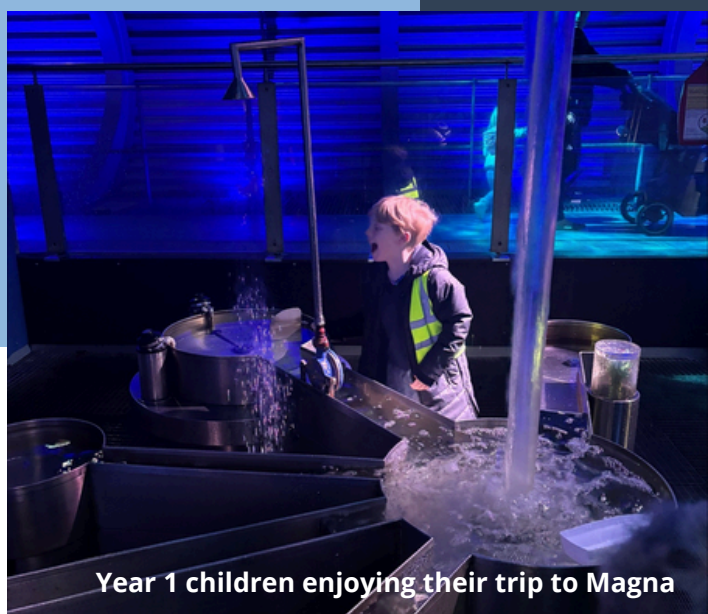
Year 1 children enjoying their trip to Magna