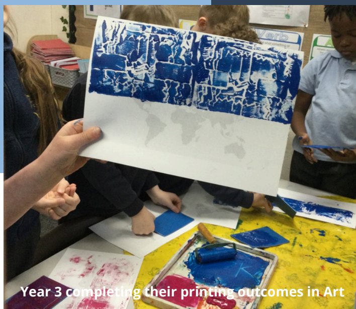
Year 3 completing their printing outcomes in Art