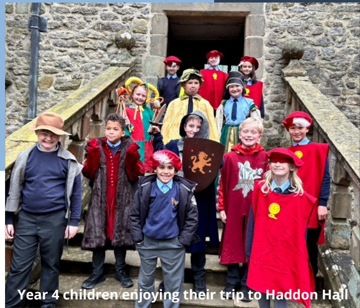
Year 4 children enjoying their trip to Haddon Hall

In Maths, we have been learning about decimals, thinking about how they follow on from fractions and exploring how dividing by 10 helps us to understand decimal numbers more clearly. In English and History, we began reading Treason , which links to our topic on the Tudors. On Monday, we held our very own Tudor banquet, where the children explored the first chapters of the text in an immersive and engaging way. On Wednesday, we visited Haddon Hall, where the children had a fantastic time exploring the grounds, learning Tudor dancing, and dressing up. It was a wonderful opportunity to bring our history learning to life. Year 4 are very excited to learn more about the Tudors in coming weeks! In Science, we started our new topic on the human body, thinking about what we already know and revisiting our prior learning on the life cycle of plants. In RE, we explored the emotions linked to Pentecost, reflecting on how people may have felt during this important event. In DT, the children began thinking about what kind of pie they would like to design and make later this half term, considering ingredients and preferences. In Spanish, we have been learning vocabulary to help us create a family tree, building confidence in speaking and understanding key words. In Computing, the children have been learning about loot boxes and the potential risks associated with them when playing games, helping to build awareness around online safety.