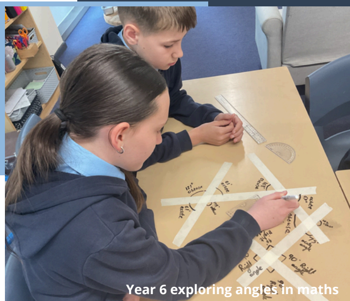
Year 6 exploring angles in maths

Year 6 have had a fantastic week. In English, they have written their own narrative extracts based on a picture of a desert that they created. They have worked hard to include different year 6 features for this. In Maths, they have learnt how to use a protector correctly, draw pie charts and measure different angles. In RE, they have conducted research into Hinduism and Islam to understand more about their culture. In Science, they have recapped their prior knowledge of electrical symbols. In RSE, they have discussed the concept of consent. Next week, they are going to write their own narrative letters from Stanley to his mum and will be completing some more SATs revision.