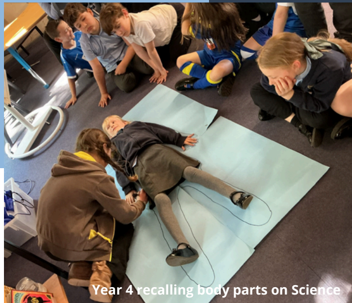
Year 4 recalling body parts on Science