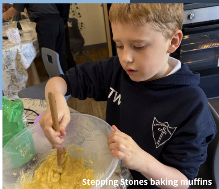
Stepping Stones baking muffins

Year 6 have had a lovely week completing lots of revision ready for their SATs. In maths, they have been exploring angles in a quadrilateral and triangles. This was something they initially found tricky, but solved in the end. In English, they have written an informal letter as part of their holes unit from Stanley to his Mum. In Science, they have considered different types of materials to be insulators or conductors. In RSE, they have considered who their safe adult is and where they feel safe in school as part of their learning for safety. In Music, they have discussed the different timbres of instruments that can be heard in 9 to 5. Next week, they are going to write a formal letter demanding that Camp Green Lake be closed immediately.