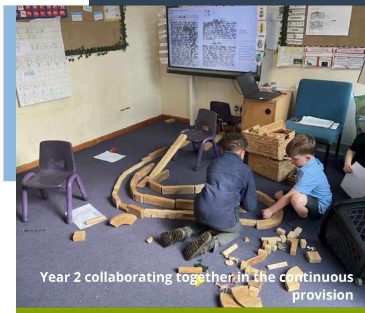
Year 2 collaborating together in the continuous provision

This week we have been learning about parts of a plant through the Creation Story. Foundation are very excited that we are going to begin landscaping our classroom garden - we can't wait to start planting pretty flowers. In English, we started to write a recount of our class trip to White Post Farm. We also enjoyed writing our thoughts about the trip in our class spirituality journal and discussing how we connected with nature. In maths, we have continued to strengthen our knowledge of number bonds and addition up to twenty. We got very competitive playing race to twenty; the class were able to show how strong their addition skills are becoming. Our favourite part of the week was finally getting to complete our Easter egg hunt. We were very disappointed as a class, last term, when we could not complete one due to poor weather. However, we kept our promises and let the children hunt for their bunnies - which the play team made really challenging! This week in our class art time, we made dot paintings. Our class art time is starting to help the children be more creative; they have tried to be more experimental in our creative area.