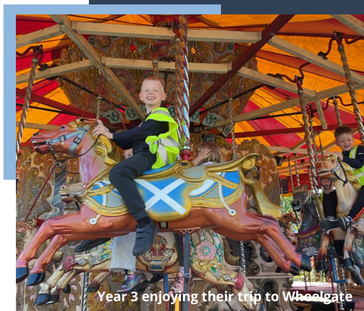
Year 3 enjoying their trip to Wheelgate

Year 3 have had a wonderfully busy and exciting week. In Maths, they explored mass and capacity, using practical activities to deepen their understanding. In English, the children began planning a thoughtful letter from Lucy to Mr Tumnus, linking beautifully with our new class novel, and they were absolutely captivated by the film. Science brought more creativity as they learnt about and illustrated the life cycle of a flowering plant. During P4C, the class discussed safety and making sensible choices with trusted adults. In Art, they experimented with shades and tints in preparation for their own Starry Night inspired artwork. In RE, the children learnt about Islam, creating vibrant posters showing where and how people worship, as well as the importance of the Holy Book. To top it all off, they had a fantastic time at Wheelgate on Monday, exploring adventure tourism as part of our new Geography unit.