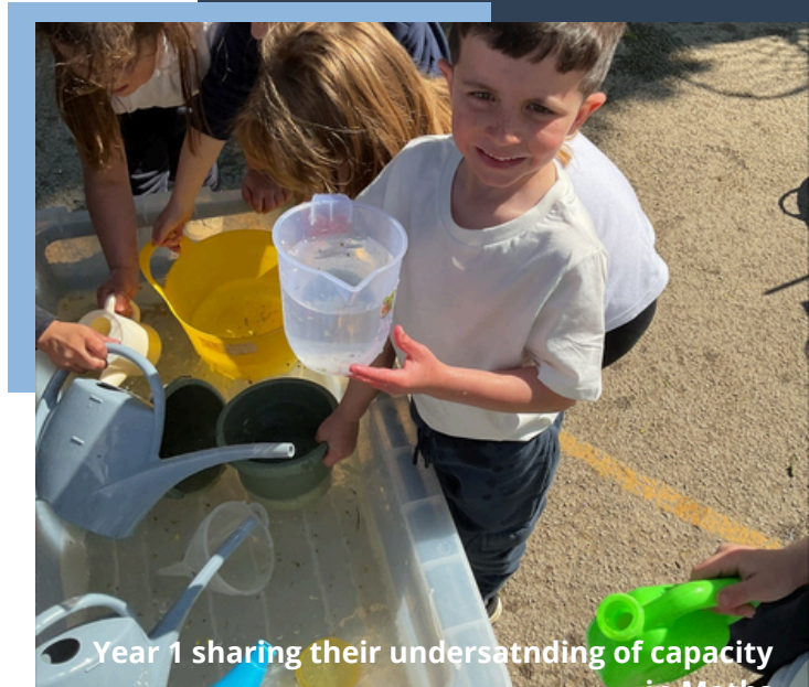
Year 1 sharing their understanding of capacity in Maths

In our wider curriculum topics, we've looked at the equator in geography and located hot and cold places on earth. In history we've started looking at the Egyptians and in science we've been learning about plants. We've enjoyed planting our own beans and we're looking forward to seeing how they grow!