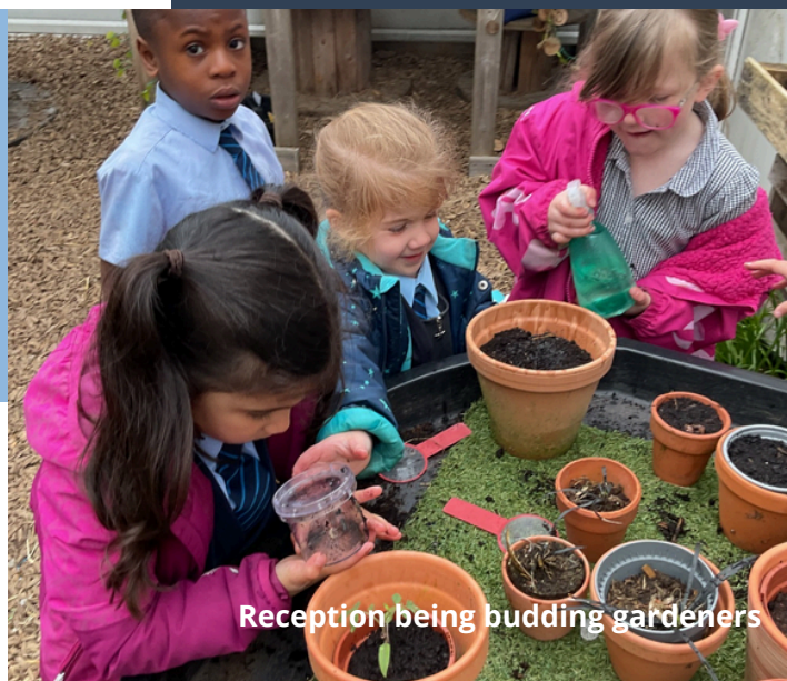
Reception being budding gardeners

Year 3 have had a wonderfully busy and exciting week. In Maths, they explored mass and capacity, using practical activities to deepen their understanding. In English, the children have finished planning the end of their letter from Lucy to Mr Tumnus, linking beautifully with our new class novel, and they were absolutely captivated by the film. We have even watched the second! During P4C, the class discussed relationships and what the characteristic of a good friendship is. In Art, they researched our focus artist and created a design page. In RE, the children learnt about Islam, a visual representation of the times of day a Muslim might pray. To top it all off, they had a wonderful time doing some outdoor play on Friday afternoon as a reward for working so incredibly hard this week!