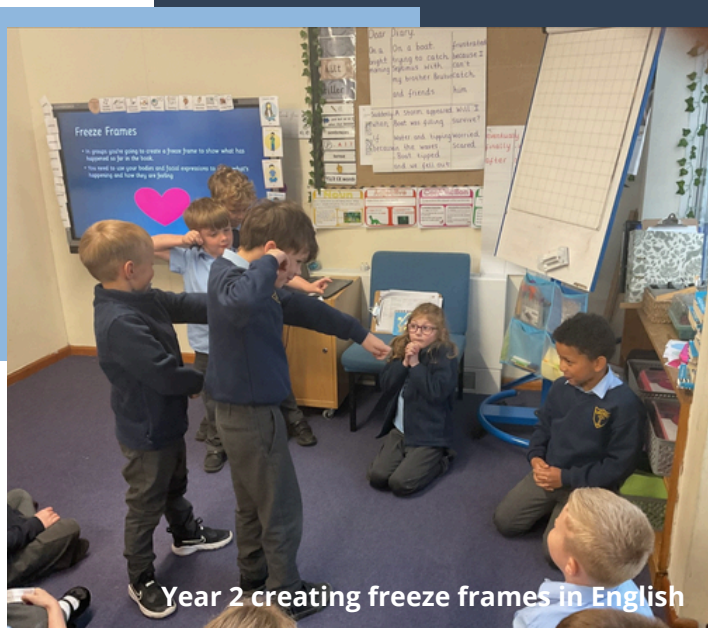
Year 2 creating freeze frames in English