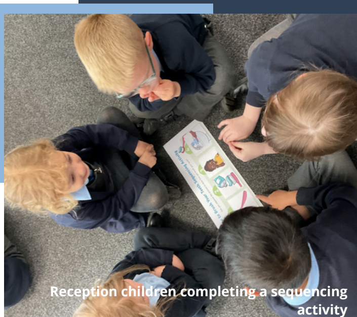
Reception children completing a sequencing activity