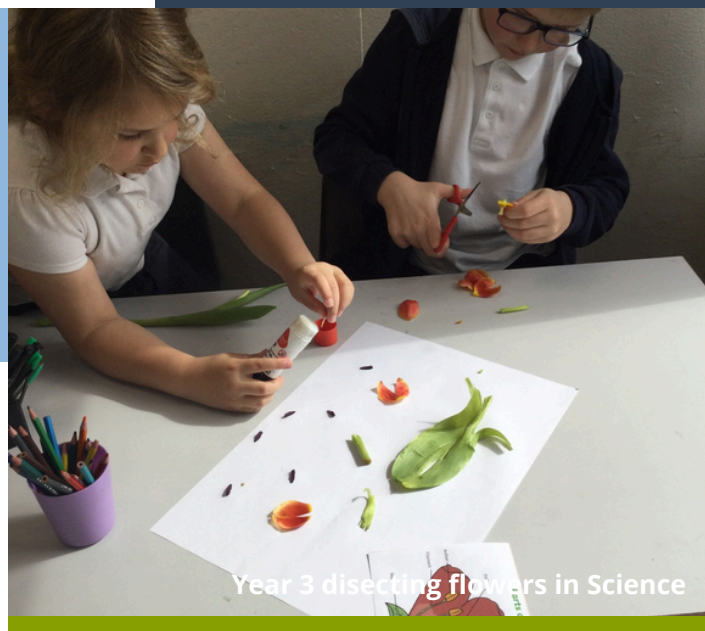
Year 3 dissecting flowers in Science

This week year 3 have been learning about the reproductive cycle of plants, we have enjoyed dissecting flowers, labelling all the key parts and discussing how each part works together to produce seeds. In computing we have been learning all about branching databases, the children have done exceptionally well at creating their own databases and testing them with their peers. Year 3 have also produced some beautiful artwork, not only in their research of the post-impressionist Van Gogh, but also for their music lesson this week when they created artwork to represent how this terms focus music, Vivaldi's Four Seasons, made them feel and what it conjured in their imagination.