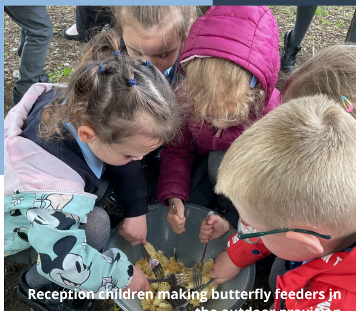
Reception children making butterfly feeders in the outdoor provision