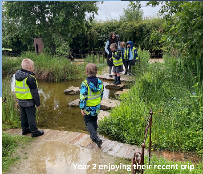
Year 2 enjoying their recent trip

In English, the children have begun unpicking our class play Macbeth and are now planning their own narratives; in geography, they have researched different time zones and explored the meaning of desertification; in RE, they have been learning about the Jewish laws that were put in place during the war; in art, they have explored repeated patterns and created their own using cardboard; and in Spanish, they have been learning about a Spanish festival. The children also enjoyed a memorable visit to the Crucible Theatre, where they watched a performance of Macbeth . Next week, the children will be writing their own narratives based on Act 1, Scene 7 of Macbeth . They are already showing great enthusiasm and passion for this task, and it has been wonderful to see their engagement during our discussions. We are very much looking forward to seeing the creative and thoughtful pieces they will produce.