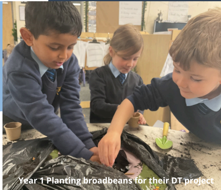
Year 1 Planting broadbeans for their DT project

Year 3 have had a wonderfully busy and exciting week! In Maths, the children have moved onto the topic of Money and have been looking at pounds and pence. In English, they have planned and written the first two paragraphs of their informative article about the Battle of Hastings. In DT, the children have thought about the type of tapestry they are going to make based on the Bayeux Tapestry. In RE they looked at the features of a mosque and the semblance behind this. In Computing, the children thought about online bullying and making kind choices when speaking with their friends. They were given a range of scenarios and had to decipher what would be the best outcome.