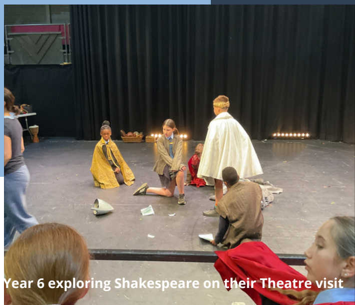
Year 6 exploring Shakespeare on their Theatre visit