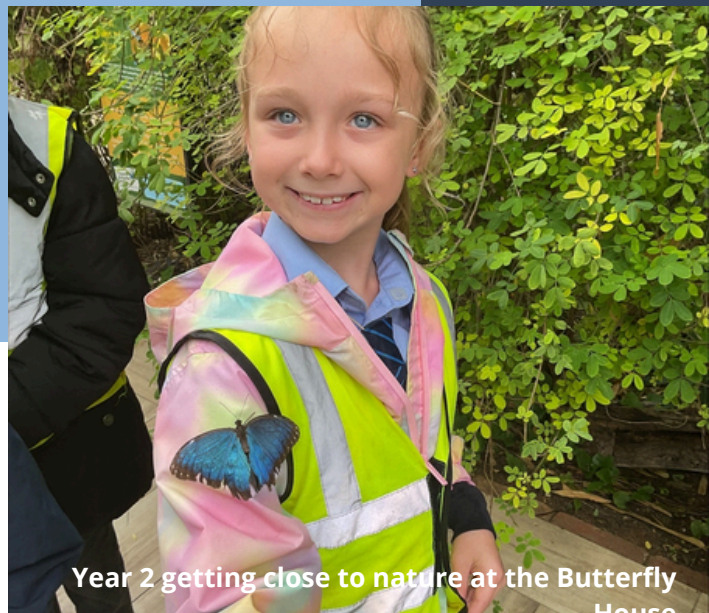
Year 2 getting close to nature at the Butterfly House