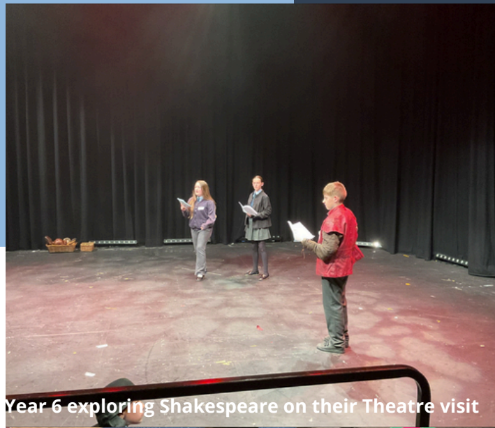
Year 6 exploring Shakespeare on their Theatre visit