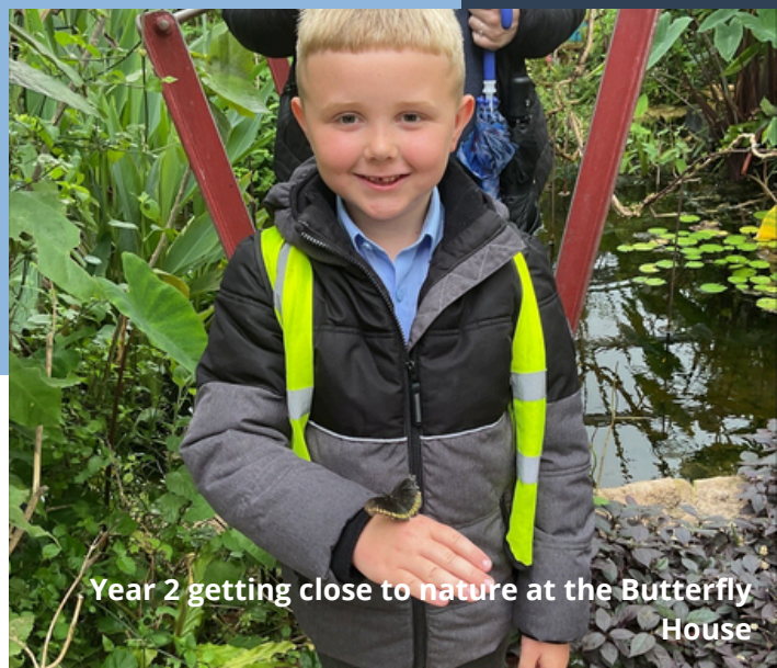
Year 2 getting close to nature at the Butterfly House