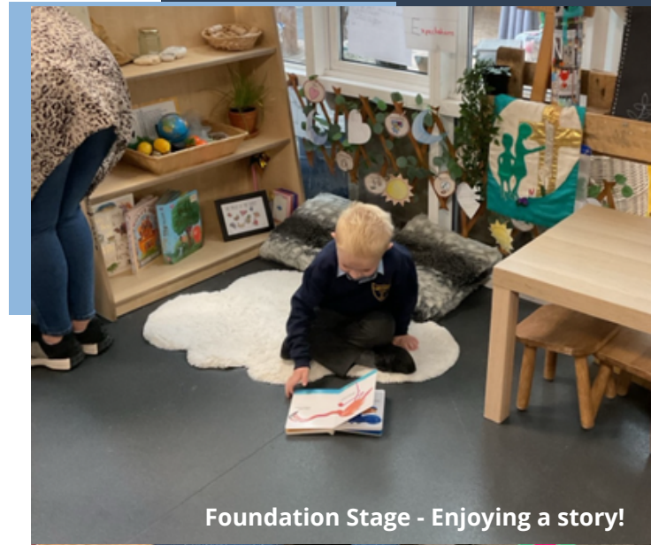
Foundation Stage - Enjoying a story!