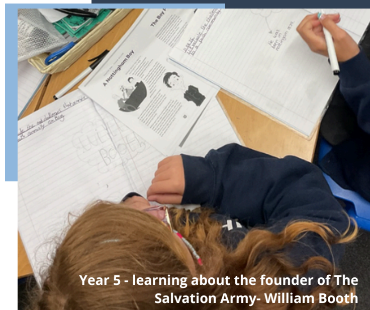
Year 5 - learning about the founder of The Salvation Army- William Booth