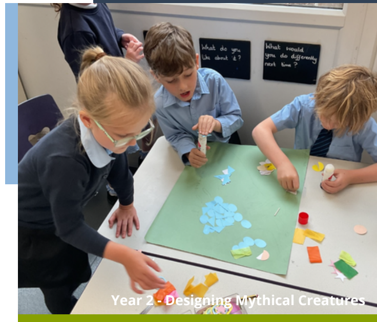
Year 2 - Designing Mythical Creatures

Year three have had a fantastic week this week, we have finished our report on the Battle of Hastings, and have made this into a published piece. Next week we will be doing an independent write for assessment week. For Maths we have been finding change with money and will be moving on to time next week. For history we have been exploring the Battle of Hastings and looking at what different things looked like during this time. In science we have been investigating different mediums for plants to grow in, we are testing which will grow the fastest. In swimming this week we have been learning about water safety and how to keep ourselves safe near open water. In RE we have been learning about Hinduism and their places of worship and in the features we can find in a Mandir. For computing we have been starting to look at collecting and recording data.