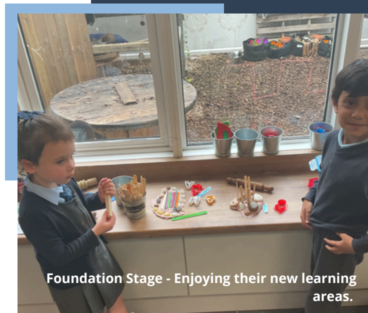
Foundation Stage - Enjoying their new learning areas.