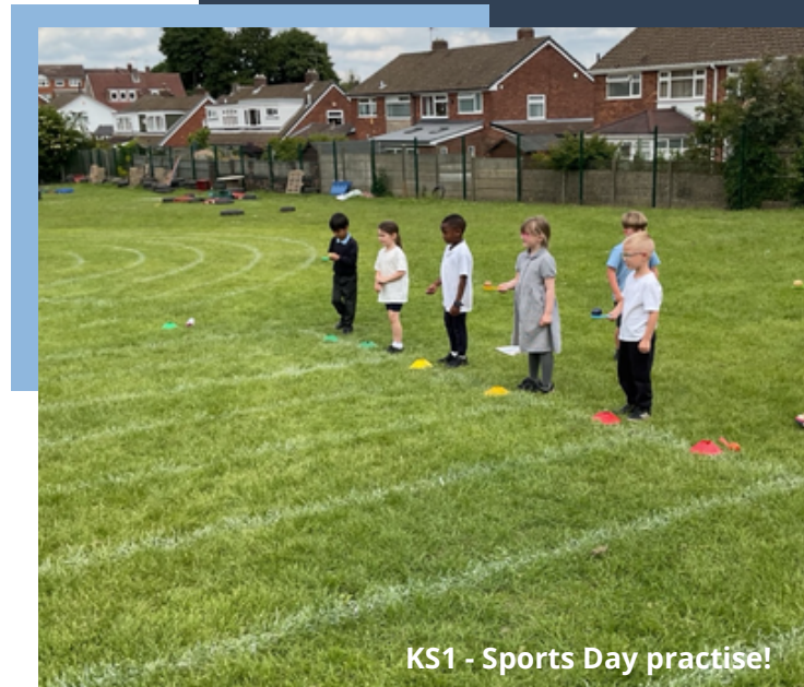
KS1 - Sports Day practise!