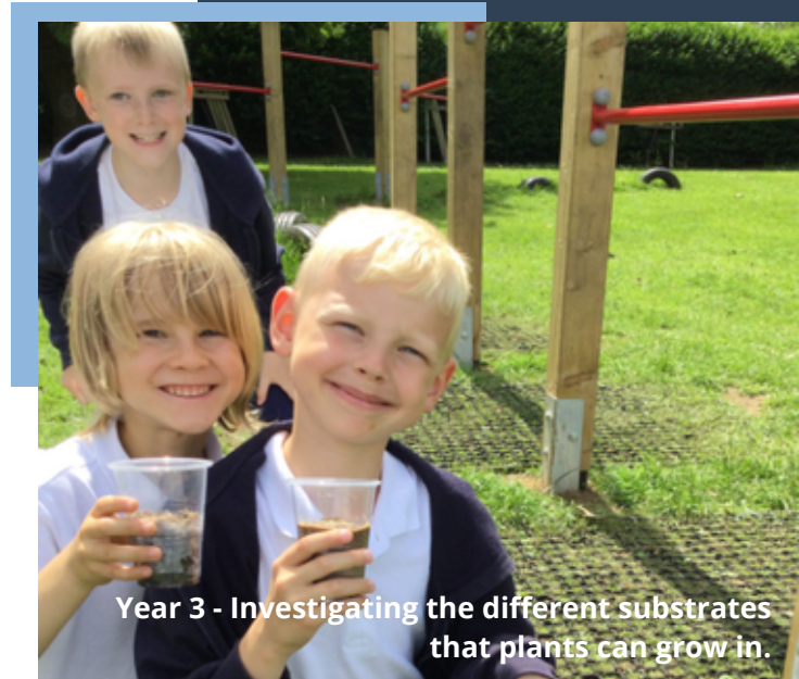
Year 3 - Investigating the different substrates that plants can grow in.