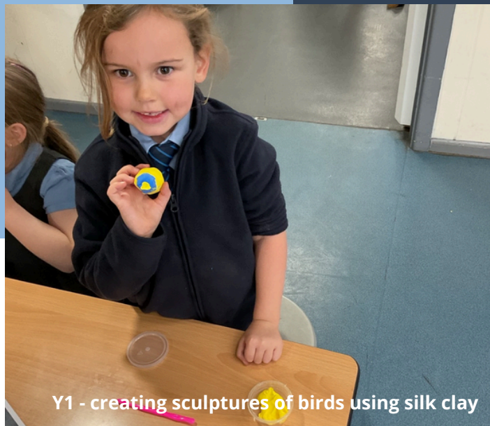
Y1 - creating sculptures of birds using silk clay

This week Year 3 have moved onto their new multiplication and division topic. We have been recapping how to use arrays, share and the 2 times table. In English we have completed the first section of our plan for the alternative opening to Iron Woman. The children have used their imaginary community to inspire their ideas and came up with some wonderful vocabulary linked to the senses! In Art, we looked at proportion and followed a step-by-step video to create a moving image of a mannequin. In Computing the children began to create their interactive scene based on the plans they made last week. It incorporated all of the technical coding they have learnt over the last term. In Spanish, the children asked and answered the question "What is in your pencil case?". We created speech bubbles in books to represent this. In RE the children looked at the difference between adult baptism and child baptism. They created two lists in their books to represent the differences.