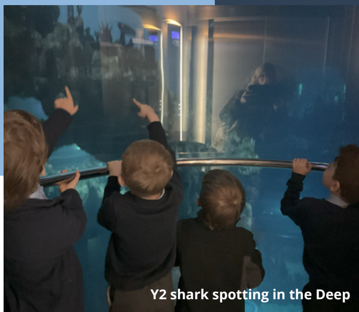
Y2 shark spotting in the Deep