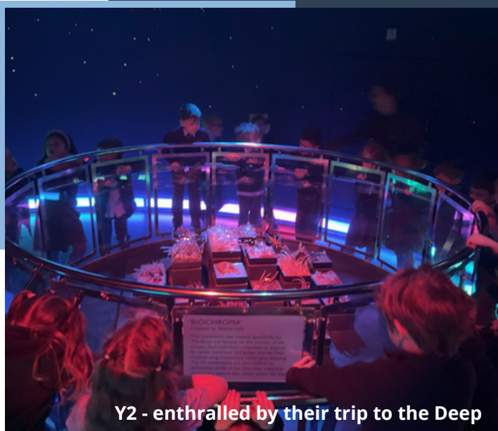
Y2 - enthralled by their trip to the Deep