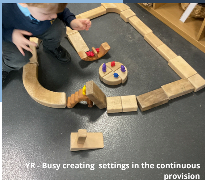
YR - Busy creating settings in the continuous provision