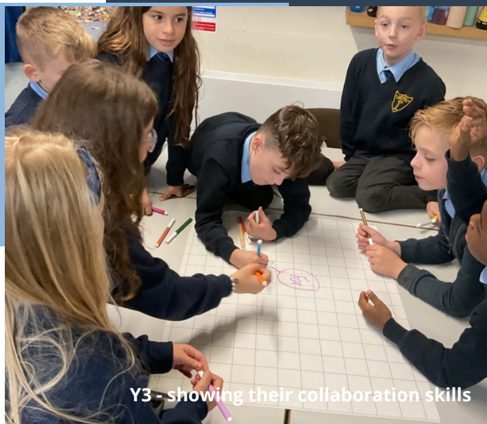
Y3 - showing their collaboration skills