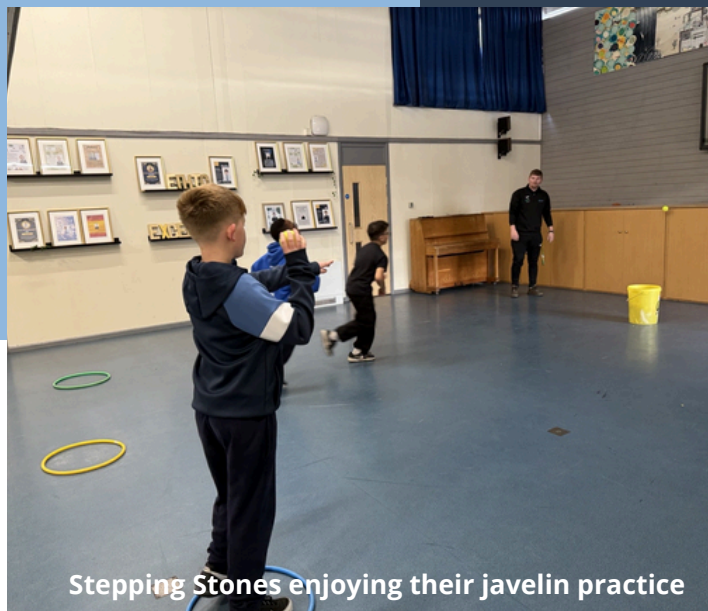
Stepping Stones enjoying their javelin practice

Year 6 have had a fabulous week completing so many wonderful pieces of learning! In Maths, they have taken on the challenge of fractions by learning how to add and subtract mixed number fractions by converting them to improper fractions and finding the common denominator. In English, they have researched their own endangered animal ready for when they write their own report. In RSE, they have considered why safety is important and have created their own enquiry questions which they will explore next week. In Science, they have carried out a research project to understand how different variations of penguins adapt to different environments. In RE, they have considered whether the story of creation and cosmology are conflicting or complementary of one another. Next week, they will continue with their writing and begin to compose their own pieces of music to raise moral for people who would have lived in the war time.