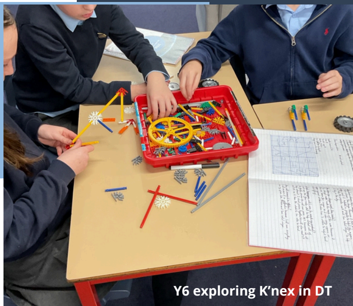
Y6 exploring K'nex in DT