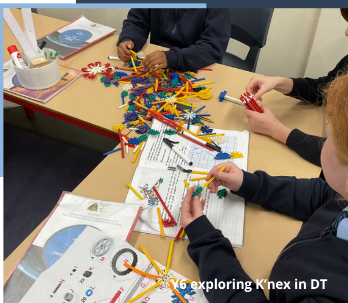
Y6 exploring K'nex in DT