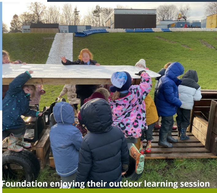
Foundation enjoying their outdoor learning session

In our outdoor learning, we went on a listening walk. We engaged our five senses, whilst touring the groundings in a hunt for signs of winter. The children loved using their hand to touch the frost on the OPAL equipment. We used the texture vocabulary we had learnt in topic to explain what we were feeling. The class have worked on being independent and working as a team, when going outdoors. The children have been taking ownership of cleaning their welly shed and helping their friends to learn to zip up their coats. We are trying to think about how to help our classmates as we are focusing on The Good Samaritan.