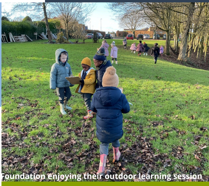
Foundation enjoying their outdoor learning session

We're looking forward to the rest of the term and exploring the rest of subjects in depth.