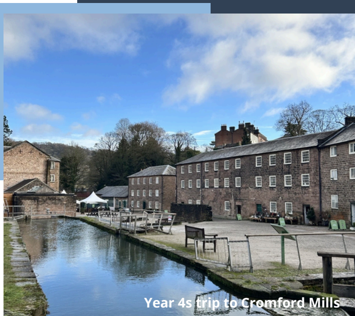
Year 4s trip to Cromford Mills

Earlier this week, we also visited Cromford Mill in DT, where the children learned about how cotton was made during the Industrial Revolution. This visit has linked directly to our DT focus on cross-stitching, helping the children to understand where fabrics come from and how textiles have been produced over time.