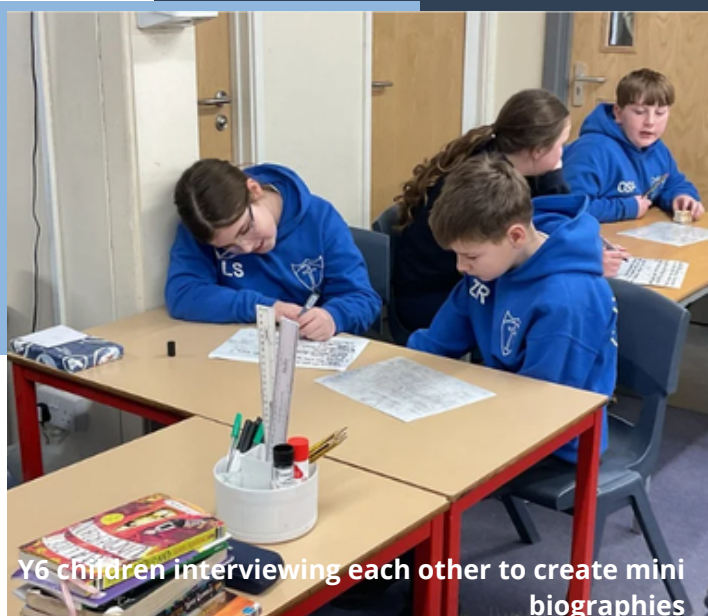
Y6 children interviewing each other to create mini biographies

Year 6 have had a lovely week! They have been learning how to convert different metric measures for mass, capacity, length and volume. This was something they found tricky at first, but have worked really hard to persevere with. In English, they have been learning about the features of a biography before moving onto learning about the passive and active voice. In RSE, the children have learnt about the safe use of social media to avoid upset and how this can link to our concept of consent. In RE, they have compared two parables and considered how they link or don't link to the Kingdom of God based on the persons decisions. In Science, they have learnt about the 4 components of blood: platelets, plasma, red blood cells and white blood cells. Next week, they will continue to learn about different biographies before researching and writing their own about Nelson Mandela. In Maths, they will also move onto learning about ratio.