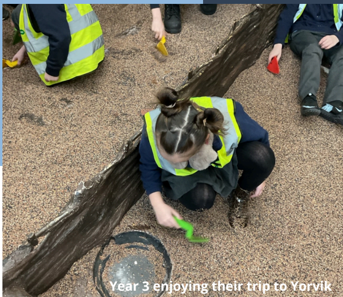
Year 3 enjoying their trip to York

This week Year 3 have started their new topic in Maths, Multiplication and Division. We have looked at related calculations and how we can link multiplication and division together. In English, we have begun their Imaginary Community for our Character Description. We are thinking about our Anglo-Saxon character and what they might look like and how they might behave. In History we had our hook day trip to York and visited the Jorvik Centre and DIG. The children had a great day and really enjoyed learning all about Anglo-Saxon life! In our Music lesson we explored Alan Silvestri's piece 'Beowulf Slays the Beast' and the children practised creating their own pieces that mirror some of the dynamics used within. After our trip, the children came back to school and explored a range of primary and secondary sources linked to the time period. In Science the children looked at the Eatwell Plate and what makes up a healthy diet. In DT we have begun to explore how we might create an Anglo-Saxon feast and the types of ingredients we might use.