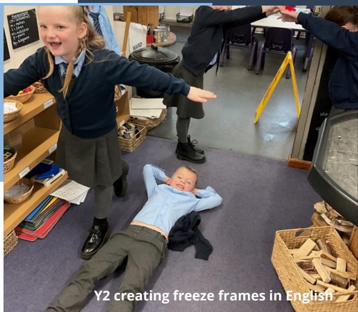
Y2 creating freeze frames in English

Year 5 have enjoyed their first week back at school after half term. They have engaged straight away into finishing fractions topic, working hard on subtracting fractions. Year 5 have also enjoyed getting started with their new text 'Oliver Twist'. Children have started to analyse characters in particular Fagin, thinking about how the writer uses different techniques to create his character. We have looked at an example of a suspense story and started collating ideas ready to plan our own.