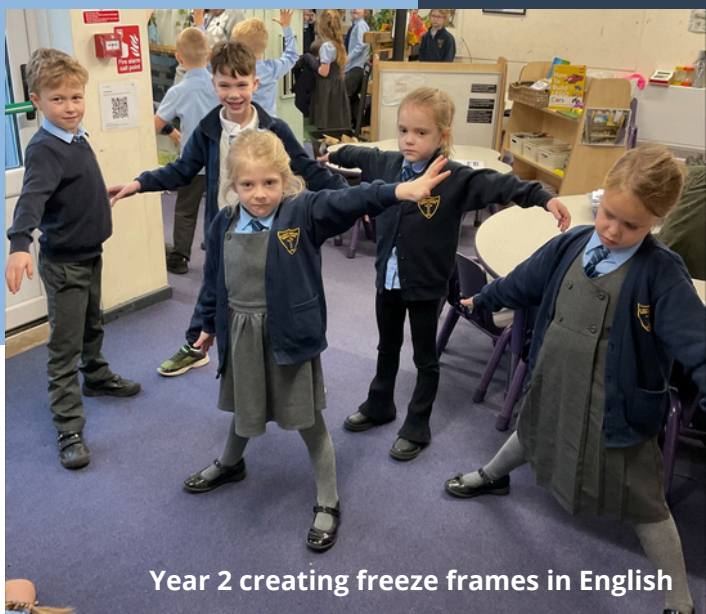
Year 2 creating freeze frames in English

Year one has had a lovely week this week, we have been continuing to explore 2-D and 3-D shapes in maths, we have been learning new words such as vertices and faces. In English this week we have started our new story for this half term, we have been starting to look at a character description for Rapunzel. We have been recapping adjectives and nouns for this! In History we have looked again at historical sources and whether these are primary or secondary sources. In RE this week we have looked at people we would choose to help us if we needed it, we chose 12 different people like Jesus chose 12 different disciples, we also learnt about why Jesus picked Mathew to be a disciple even though he wasn't thought to be a good man. In Pe we have started to learn about gymnastics, we have been practising some different stretches such as pikes, straddles, and tucks.