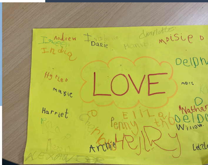
Foundation Stage exploring the value of Love