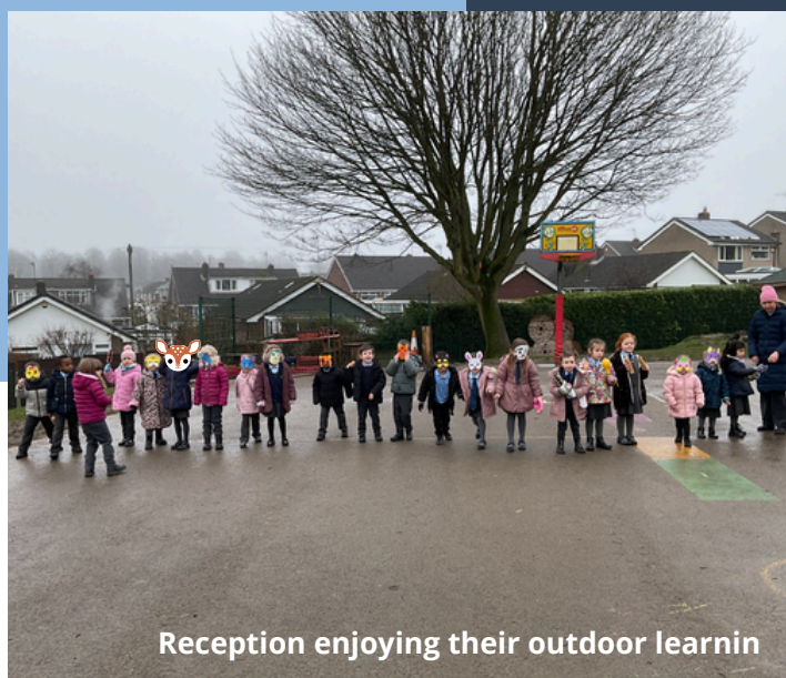
Reception enjoying their outdoor learning

This week year 3 have continued their new topic fractions and have been looking at how we can identify unit and non-unit fractions. In English we have begun writing our recipe for Anglo-Saxon stew. The children had a wonderful day on Monday making their stew in DT and unanimously decided it was delicious! In RE we read and ordered the story of Abraham and Sarah and thought about how this links to the idea of faith in God. In History we completed our timelines and will move on to significance next week. In Computing the children did their online safety and thought how profiles differ online. In Spanish we practised asking and answering the question "what do you call your pets?".