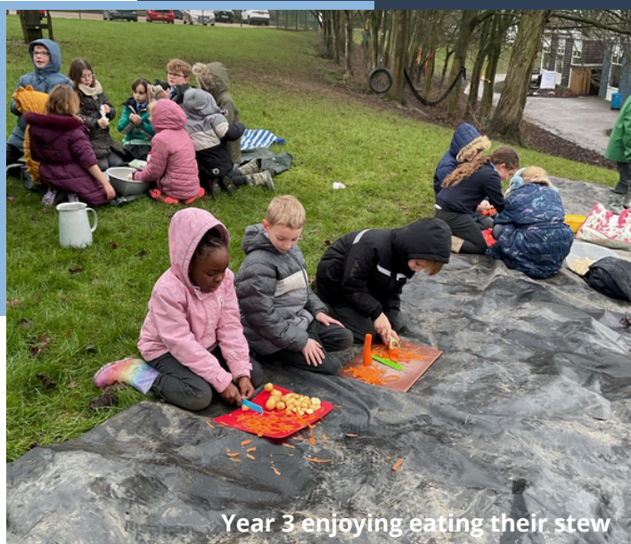
Year 3 enjoying eating their stew

Year 6 have had a fantastic week. In Maths, they have mastered algebra and have become real superstars at it! In English, they have started create their own imaginary community based on the segregation of a community. They are then practising writing formal sentences which will form the basis of their speech. In History, they have created their own timelines based on the events of apartheid. In Computing, they have created their own adventure story using a plan that they created last week. In RSE, they have considered what they need to have healthy relationships and how this can be put into practise. In RE, they have created their own project which had the aim of improving the community as we know it to make it more like the Kingdom of God. Next week, they are going to write their speeches.