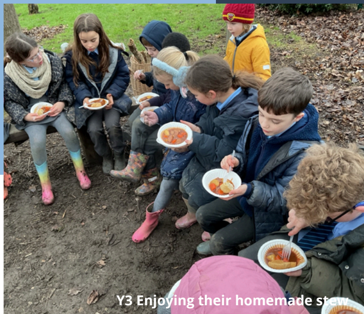
Y3 Enjoying their homemade stew

In DT, the children have been cross-stitching embroidered pieces as part of an immersive rainforest environment, carefully developing their sewing skills while considering how their work contributes to a shared final outcome.