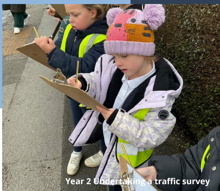
Year 2 Undertaking a traffic survey

Year 2 have had a busy week! In maths, the class have been exploring shape. They have looked at vertices, sides, edges and have practised making patterns too. In English, the class have produced some beautiful non-chronological reports linked to giraffes. They have included images, subheadings and fun fact boxed too. They should be very proud of their outcomes! In provision, the class have been very creative! We have had lots of animal based non-chronological reports being created, some beautiful rainbows and lots of small world creations. In Geography, the class have been on a local walk to complete a traffic survey. They spotted lots of cars and vans. They were very pleased when the bus driver waved at them too! In DT, the class have been creating their draw-string bags. Next week, we will be writing independent writes linked to animals and our science learning too. In maths, we are moving on to looking at money. We will be exploring coins and notes next week. In Geography, we will be creating a map with OS symbols, a key and a compass to represent our local walk.