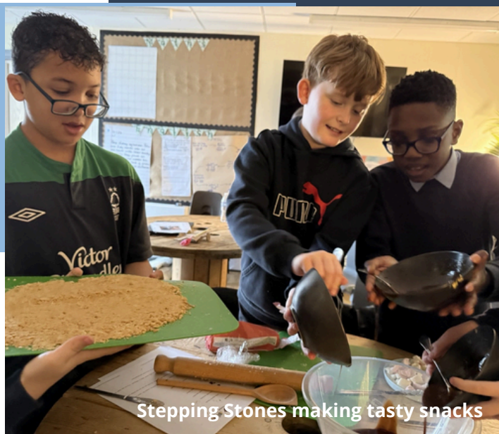
Stepping Stones making tasty snacks

In Maths, we have been focusing on our own individual targets based on multiplication. We have been using our concrete resources to work out a range of multiplication activities. We've also been very creative and made our own lava lamps using oil, bicarbonate soda, vinegar and food colouring.