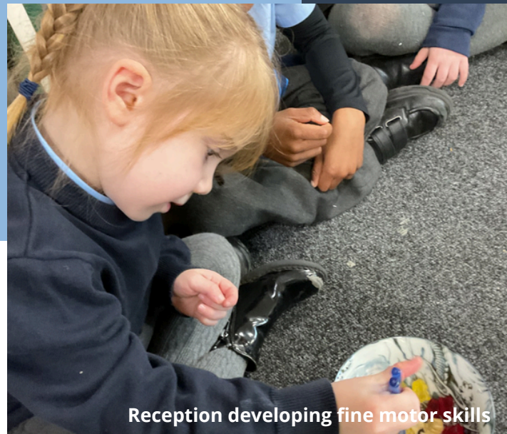
Reception developing fine motor skills

The week was also rich in practical and creative learning. During PE, Year 9 students from SCA led a range of ball game activities, which the children approached with enthusiasm and great teamwork. In DT, they applied their cross-stitching skills to produce embroidered pieces for the class's immersive rainforest environment, carefully developing their sewing techniques while contributing to a shared final project.