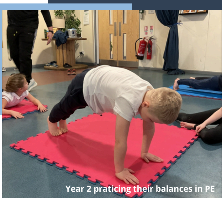
Year 2 practicing their balances in PE