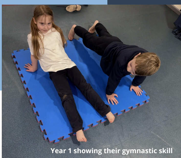
Year 1 showing their gymnastic skill