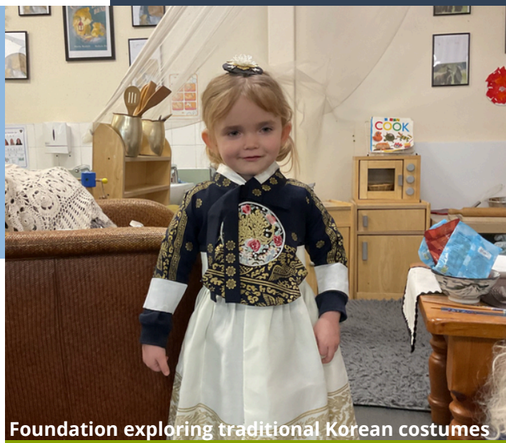
Foundation exploring traditional Korean costumes

This week year 3 have continued their new topic fractions and have been looking at how we can order fractions from greatest to smallest. In English we have completed our recipe and will write an independent write after half term, all about how to make bread. In DT we completed our evaluation of our stew, it was hard for the children to think of things they didn't like! In History we looked at the significance of the Anglo-Saxons on modern day Britain. In RE we looked at how Christians live their values in the community and specifically, the Salvation Army. In Computing the children began to create their own PowerPoint and wrote about their pets in Spanish as a piece of extended writing.