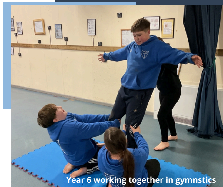
Year 6 working together in gymnastics

Year 6 have had a fantastic week completing so many different elements of their learning. In English, they have continued to write their formal speeches to the House of Commons regarding the segregation that has been imposed on their once beloved community. In Maths, they have been recapping their knowledge of place value and how to add and subtract decimals before moving onto trickier concepts after the half term. In Computing, they have corrected and debugged different types of code to allow a text adventure story to work. In PE, they have worked together to create different balances. In music, they have looked at different tempo terminology and have used this to create different types of music. In Science, they have looked at the impact that drugs and alcohol can have on the body. After the half term, the children are going to be exploring light in science and focusing on different maths topics.