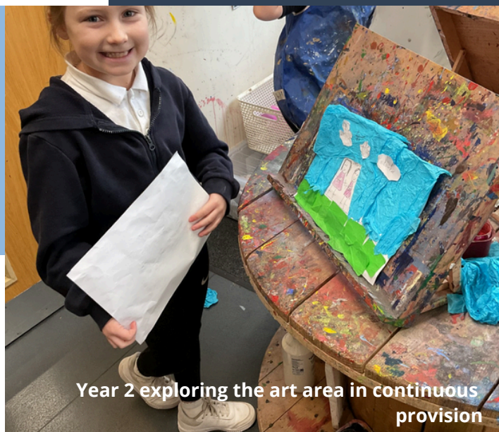
Year 2 exploring the art area in continuous provision

This week in Year 3 we have completed our learning on fractions and are going to begin looking at length and measurement. In English we have completed an independent write and are going to begin our new novel next week. In RE we looked at the Big Frieze and the order this goes in. We created a timeline in our books to represent it. In Computing we looked at adding media to our 'All About Me' PowerPoints and making the slides transition in and out. In P4C we looked at consent and the different ways we are able to give and refuse this. In Art we began creating our own ornamental patterns, patterns we could use for decoration. In Spanish we played Bingo! to recap our classroom language learning. The children had remembered lots!