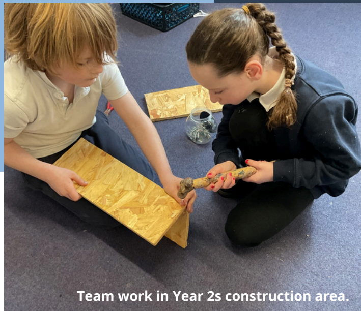
Team work in Year 2s construction area.

In Maths, we have been finishing our unit on length and perimeter, applying our knowledge to polygons and rectilinear shapes. The children have been carefully measuring, calculating, and reasoning about how to find the perimeter of more complex shapes. In English, we began thinking about writing a persuasive letter to Cadbury about their use of palm oil in chocolate. This links closely to our Geography topic this half term. The children are incredibly passionate about saving orangutans and promoting more sustainable chocolate, and they are already generating strong arguments and persuasive language ready for drafting. In Computing, the children have been developing their touch typing skills to prepare them for more effective and efficient searching and digital work. In Art, we were introduced to Pablo Picasso and explored the style of Cubism. The children examined how faces and objects can be represented from multiple viewpoints and began thinking about tints in the artwork. In RE, we started looking at the Easter story, focusing on the days of Holy Week and reflecting on their meaning and significance. In Music, the children began composing their own pieces inspired by Jai Ho, experimenting with different instruments and thinking carefully about rhythm, dynamics, and atmosphere. In Science, we have been learning about habitats and how animals adapt to their environment, exploring how specific physical and behavioural features help living things survive.