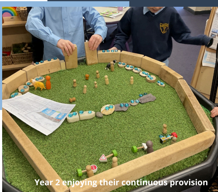
Year 2 enjoying their continuous provision