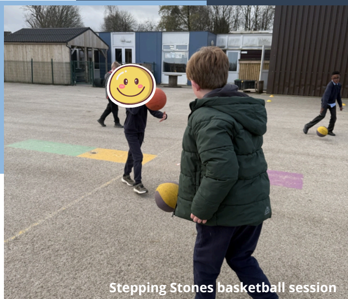
Stepping Stones basketball session

Year 6 have had a brilliant week which started with some digging in the mud put on Monday as a hook session to their new novel of Holes. Afterwards, they analysed a missing chapter narrative before choosing to focus on accurately describing to show not tell and the use of dialogue. In Maths, they have been learning how to multiply and divide by 10, 100 and 1,000 before multiplying and dividing decimals. In RE, they have explored the resurrection of Jesus and considered how this gives people hope. In P4C, they have discussed the topic of consent. In Art, they have continued with their self portraits from last term as they want to perfect them. Next week, they are going to plan and begin to write their own narrative based on the missing chapter of holes from the perspective of Stanley.