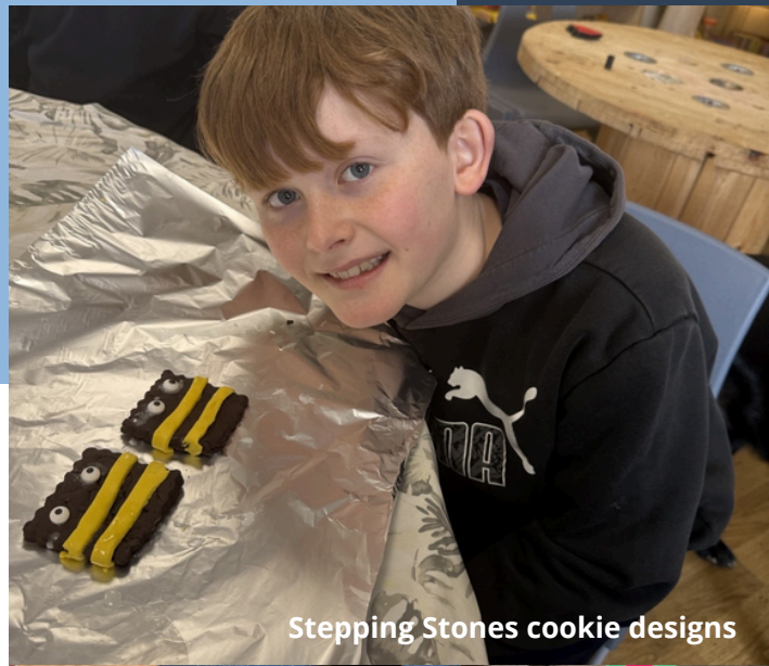
Stepping Stones cookie designs

Year 5 have had a busy and exciting week of learning. The children have been diving into their biography unit by exploring the fascinating life of Queen Victoria, discovering how she shaped Britain during her long reign. In science, they carried out a hands-on investigation into soluble and insoluble materials, testing different substances to see which would dissolve in water and discussing why these changes happen. They also continued their work in music, looking closely at the song Consider Yourself from Oliver! and exploring its meaning, themes, and the emotions it tries to convey. It's been a wonderful mix of history, science, and the arts, and the children have shown great curiosity and enthusiasm throughout.