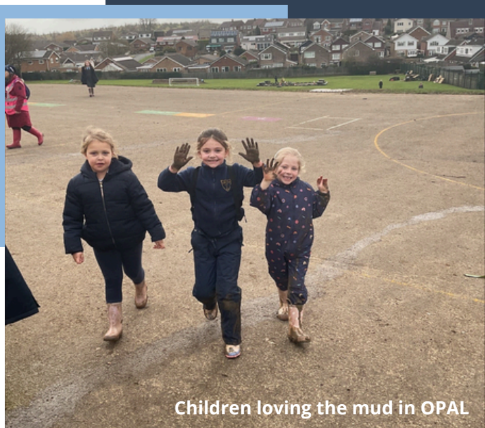
Children loving the mud in OPAL