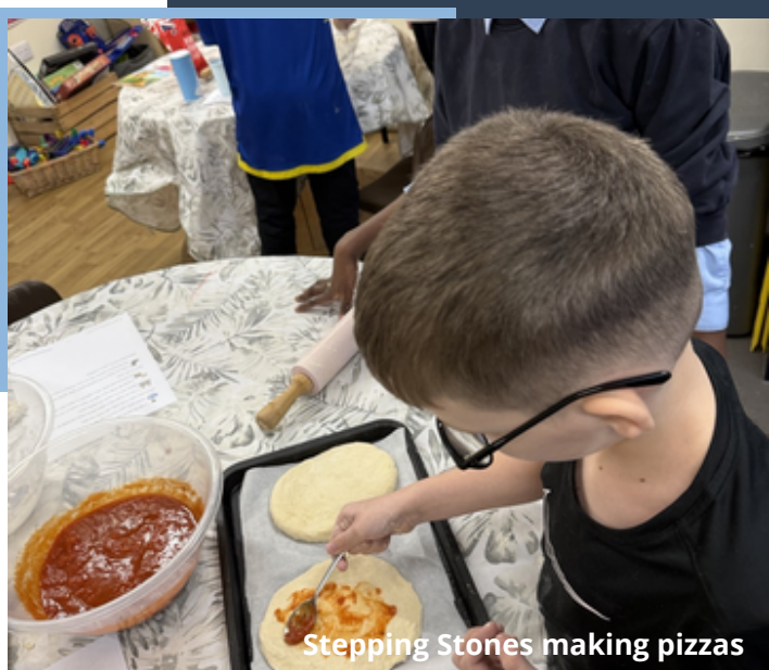
Stepping Stones making pizzas