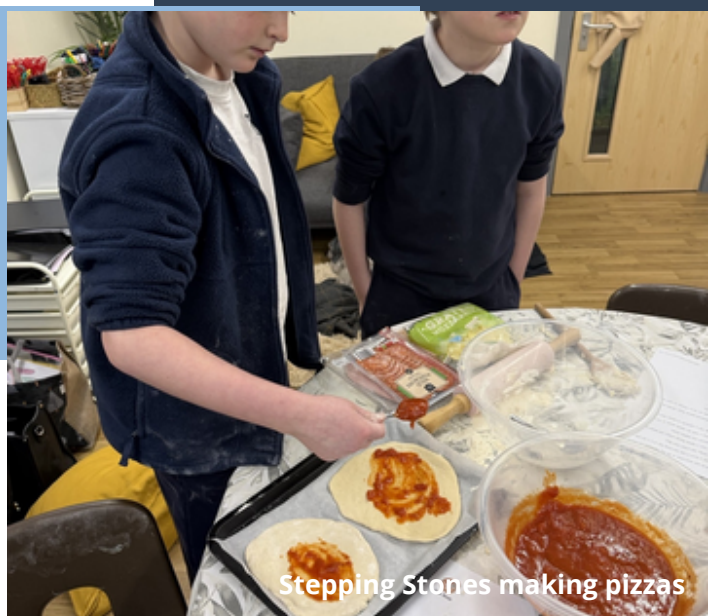
Stepping Stones making pizzas