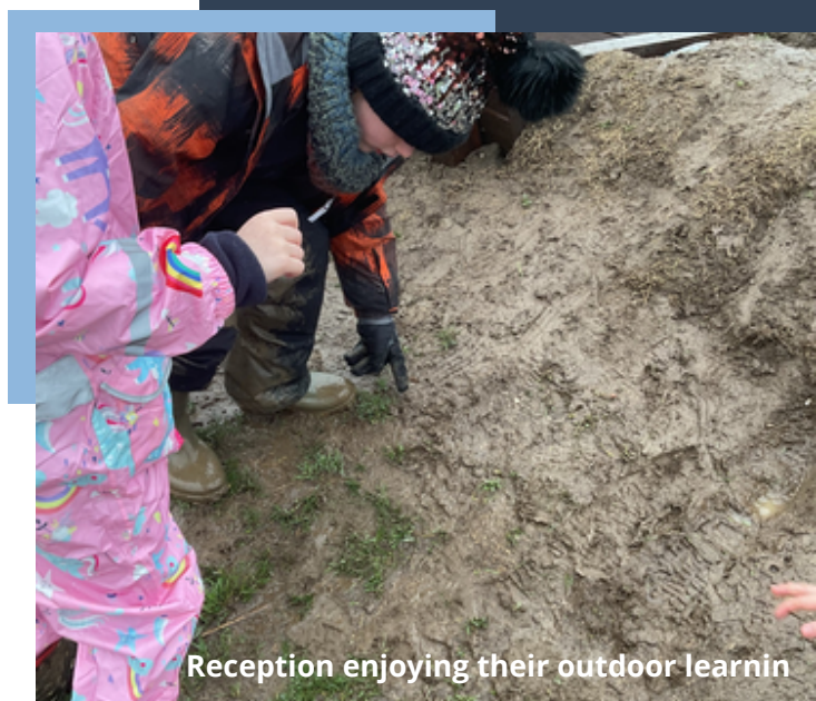
Reception enjoying their outdoor learning