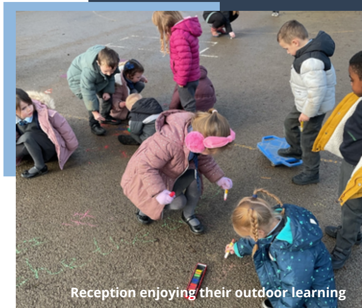
Reception enjoying their outdoor learning