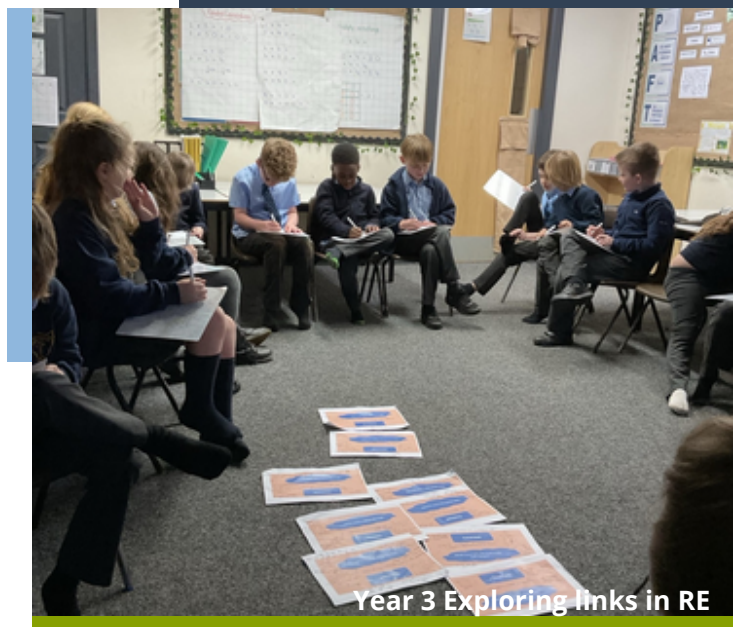
Year 3 Exploring links in RE

This week year 3 have begun their new topic, fractions! They are already experts and enjoying the topic. In English we have finished our character description, and we will begin our recipe for an Anglo-Saxon stew next week. In RE we looked at the connections between the covenants made in a wedding ceremony and those in the story of Noah. In History we completed timelines for the Anglo-Saxon period. In Music the children explored how crescendos and diminuendos look on a staff. They're really enjoying our focus piece of music! In Computing we practised logging on and off our Microsoft 365 accounts and will begin making a PowerPoint. In Spanish we created a page all about the types of pets we might have and will use this next week to write about the types of pets we do have.