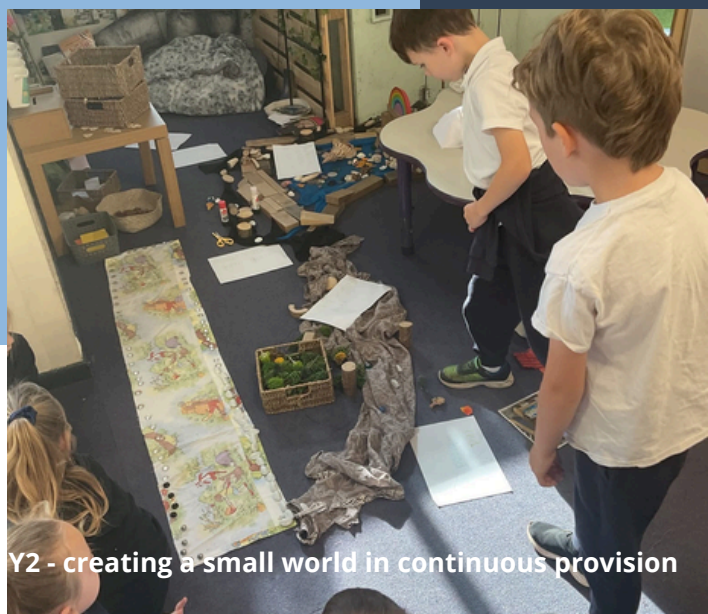
Y2 - creating a small world in continuous provision

Year 2 have had a fantastic week which has been filled with learning! In English, they began their week with their hook lesson. They created nouns and adjectives to describe areas of our story, Little Red, before working in small groups to create them. In maths, we have been focusing on Place Value more and have been introduced to number lines and finding missing values. In history, the class have started to explore The Stone Age by discussing what we already knew about this period in history. In P4C, we have explored our school's spirituality charter and have created one for our own class. They all had some amazing suggestions! In PE, we have continued with handball skills and have introduced moving with the ball in addition to finding space and throwing/catching. Provision has been filled with story writing, bird houses and Lego creations too, with some children putting amazing effort into their design brief too!