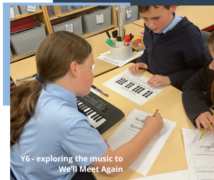
Y6 - exploring the music to We'll Meet Again

Year 6 have had a busy week completing their baseline assessments. They have worked extremely hard to complete their maths, reading and grammar papers with such resilience. After this, the children received some post! A letter from World War 2, how exciting! The children are going to explore this more next week. In Maths, the children have moved onto the four operations starting with adding and subtracting numbers which are up to 6 digits. In RE, the children have consider how the values of omnipotent, omniscient, loving, holy and eternal could make a difference to the world. In P4C, the children have considered why the use of flags can have an impact on the people around them in different ways. In Music, the children have used keyboards to interpret the different pitches that are played in their focus music, We'll Meet Again. Next week, the children are going to design and consider the safety aspects when they come to make their own meal in DT.