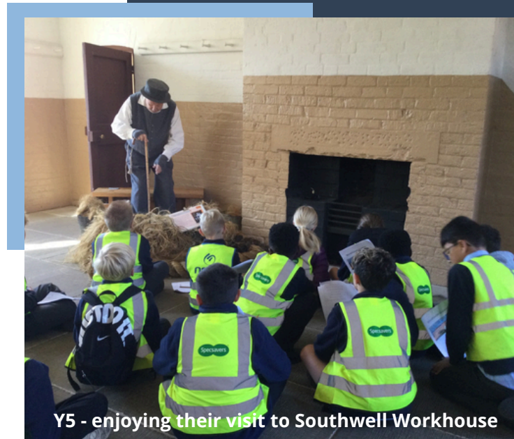
Y5 - enjoying their visit to Southwell Workhouse

Year 4 have had a busy week of learning! In English, the children have been finishing their newspaper reports, ready to publish and share their fantastic work. In RE, we explored the story of Adam and Eve and the Fall, thinking carefully about the choices they made and what we can learn from them. In Science, the children investigated states of matter, discussing how we can tell the difference between solids, liquids, and gases. Music has been particularly exciting as we explored how tempo creates suspense, and we listened to our topic's focus piece, La Mer by Debussy, to hear this in action.