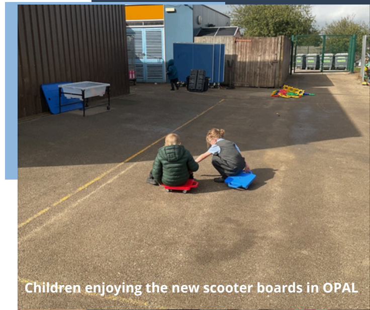
Children enjoying the new scooter boards in OPAL

This week we visited the workhouse. We were super excited on the coach and followed the road signs all the way there. When we pulled in, we spotted a large building and started to ask questions about what it could be used for. We then went inside and started to explore. We got to learn all about the workhouse and what it used to be used for. We even met some of the staff were happy to answer our questions. We got to visit the school and try on workhouse uniform to help us understand what it was like to live in the workhouse.