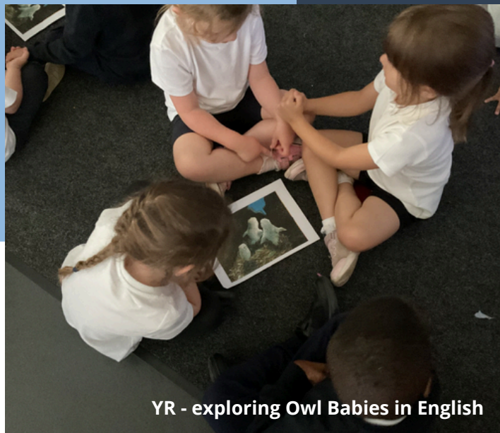
YR - exploring Owl Babies in English

In Reception, we have been sorting and matching a variety of objects as part of our math learning. Next week, we will be exploring concepts related to length, height, and capacity. In English, we used drama to explore the baby owls' feelings when they woke up and discovered that their mother was gone. We brainstormed more exciting vocabulary to describe how the owls felt instead of simply saying "sad." We also collaborated to predict where we think Mummy Owl might have gone. During our outdoor learning this week, we went on a seasonal walk to observe the changes that come with each season. We used a nature hunt checklist to locate different objects in our environment.