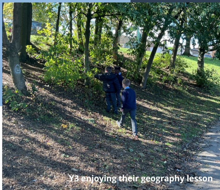
Y3 enjoying their geography lesson

This week year three have finished writing their wanted leaflet and recorded it as their final piece. Next week we will begin to write a character description all about the Iron Man! In maths we have continued with our place value topic and have been comparing numbers to 1000. In RE we explored what qualities and talents we have to offer the world just like the disciples Jesus chose. In Geography, we went on a scavenger hunt to find OS symbols that we might find in a map. We will use these in upcoming lessons to create our own route to Lammas Leisure Centre. In DT, we completed our design briefs for our catapults and will begin to build this next week. In Computing, we looked at flowcharts and how to create these on PurpleMash to order the code.